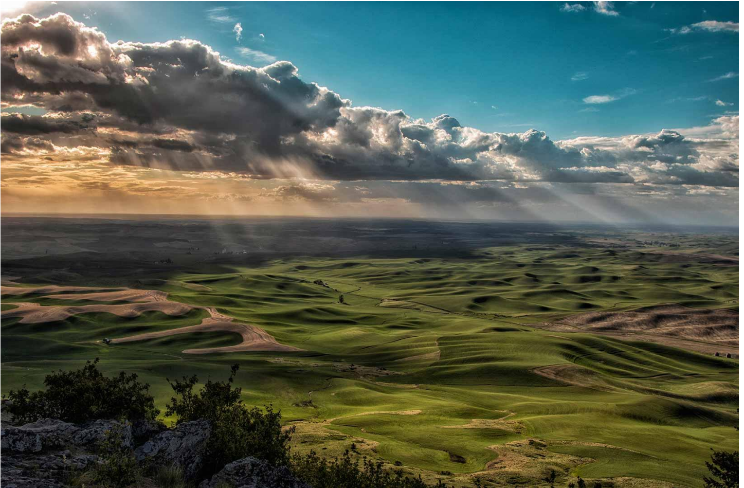
Cover Image: God's Country – Sonya Lang

All images in the newsletter are property of the photographer and all rights are reserved.