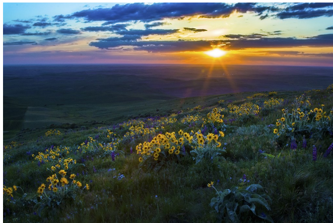
Third Place Steptoe Sunset Sonya Lang