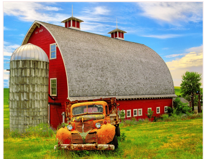
Third Place Barn and Truck Renata Kleinert