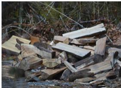
Weathered Wood 2 - Sonia Rahm