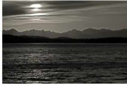
Alki Sunset - Sherrie Tallman