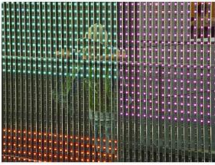
In The Lights - Dell Deierling