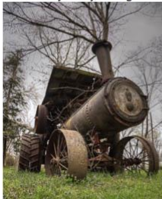
steam tree tractor - Tim Garton