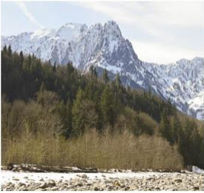
Index - Sonia Rahm