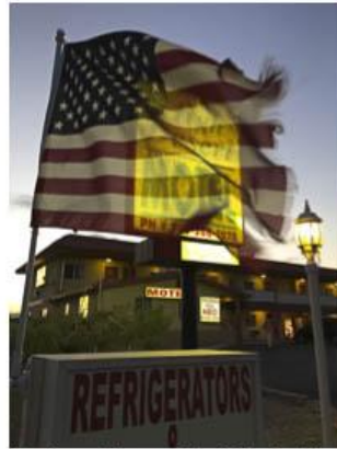
Joshua Tree - Dell Deierling