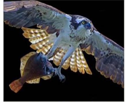
Osprey Caught A Fish - Renata Kleinert