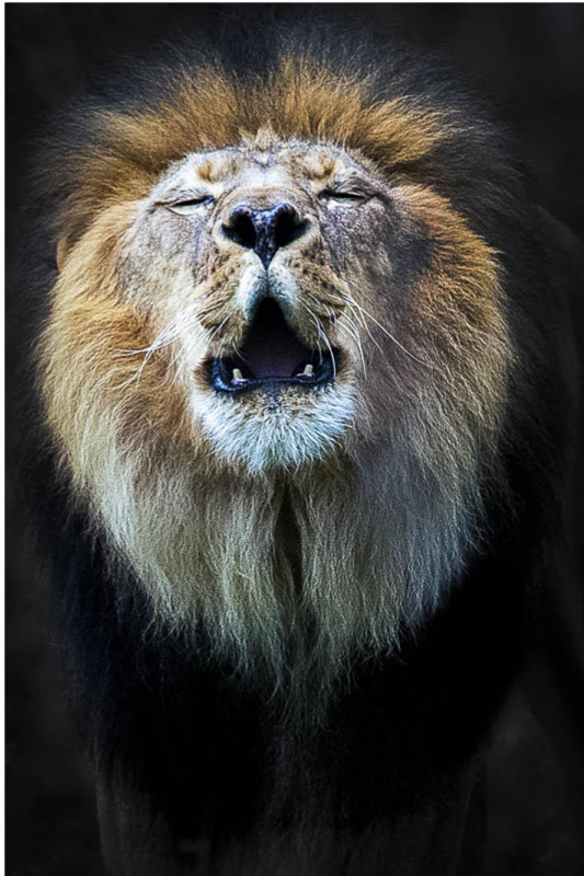
Hitting the high note-Sonya Lang