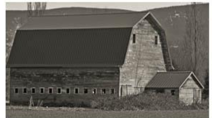
Old Barn in need of Paint - Sonia Rah