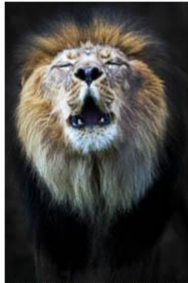
Hitting the high note-Sonya Lang