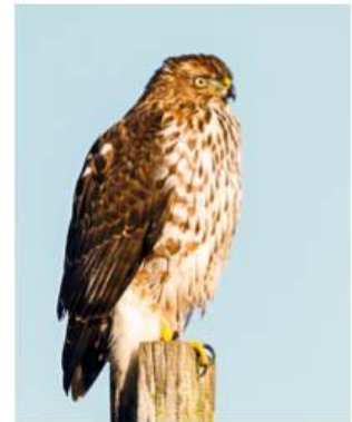
Cooper's Hawk Portrait