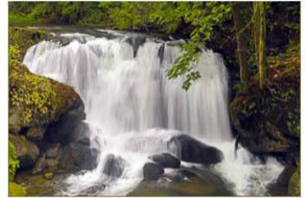
Whatcom falls - Renata Kleinert