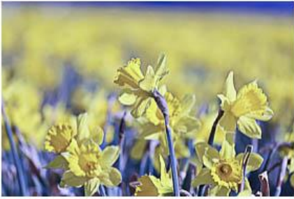
Spring Time-Donna Branscome