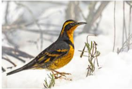
Varied Thrush - Bill Schwarz