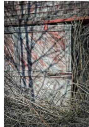
Shadows Past-Sonya Lang