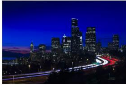
Seattle Sunset and Light Trails - Sher