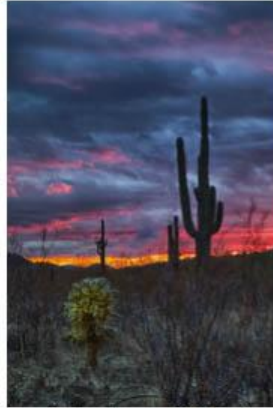
Sunset Cactus - Bill Schwarz