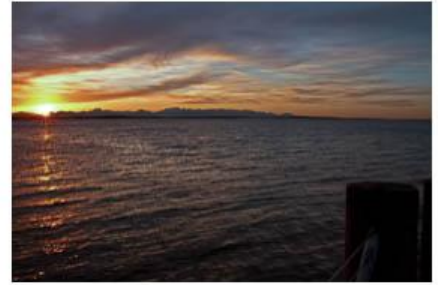
Sunset at Luna Park - Sherrie Tallma