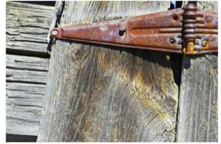
All Weahered Up-Donna Branscome