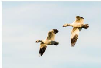
Snow Geese In Flight - Steve Lightle