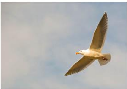
Gull Wing - Jon Racz