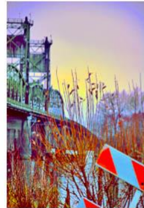
Violet Haze - Jon Racz