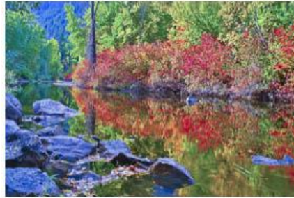
Autumn Reflections - Renata Kleinert