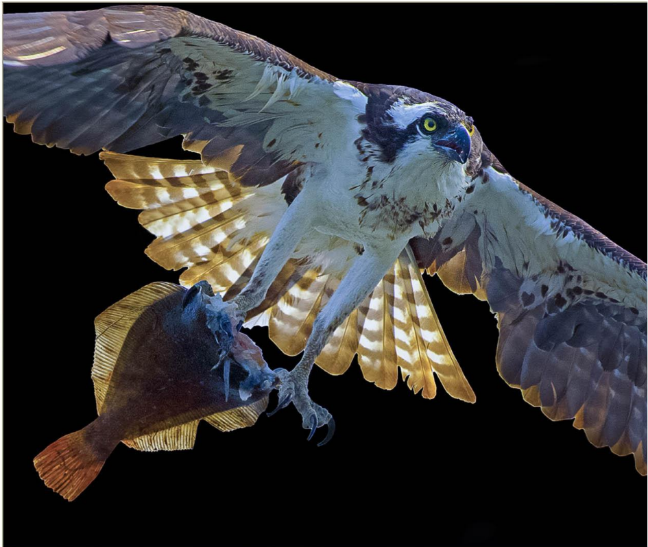
Osprey Caught A Fish - Renata Kleinert