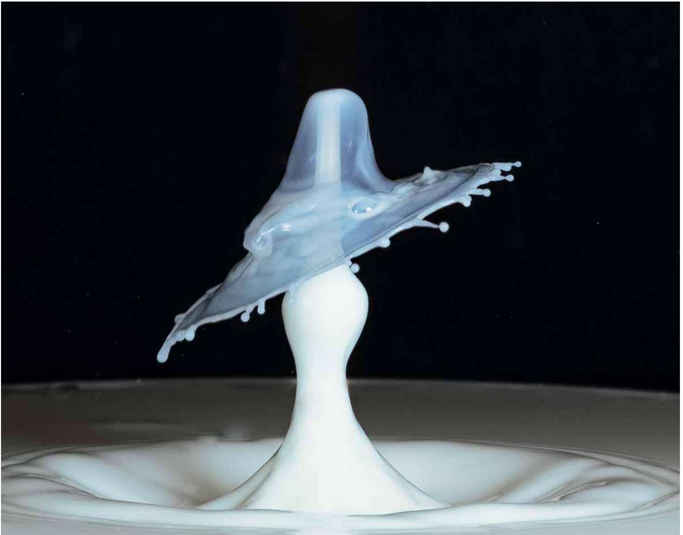
Cover Image: Bride and Veil – Juan Stout

All images in the newsletter are property of the photographer and all rights are reserved.