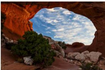
Broken Arch #1 - Steve Lightle