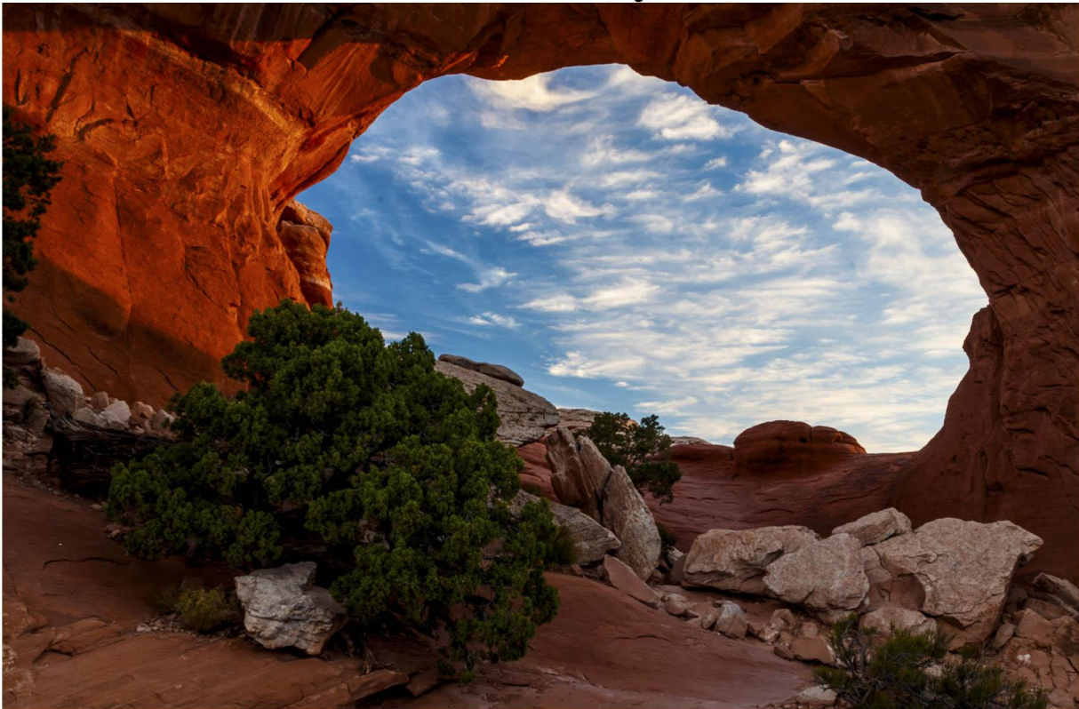
Broken Arch #1 - Steve Lightle