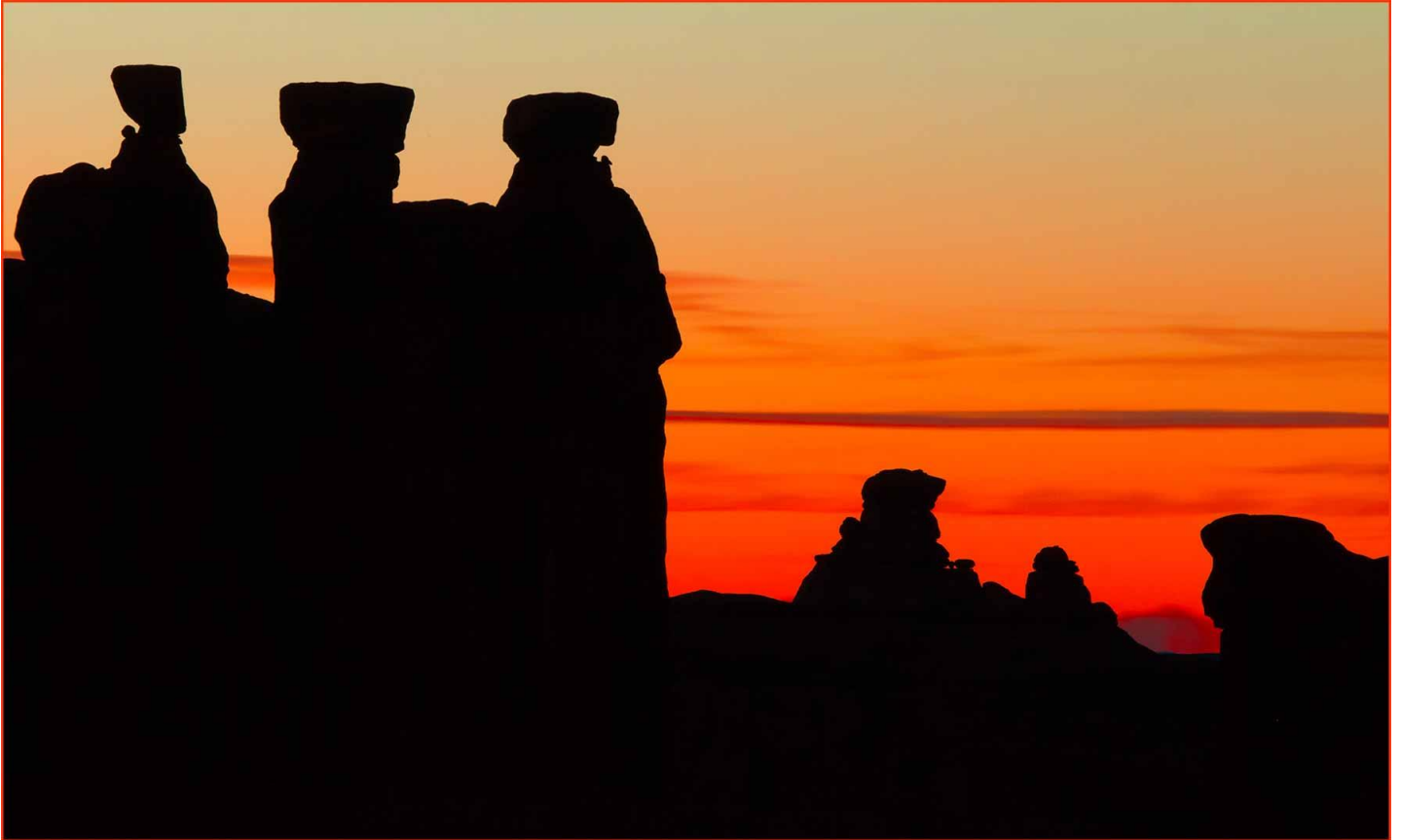
Cover Image: Three Gossips – Renata Kleinert

All images in the newsletter are property of the photographer and all rights are reserved.