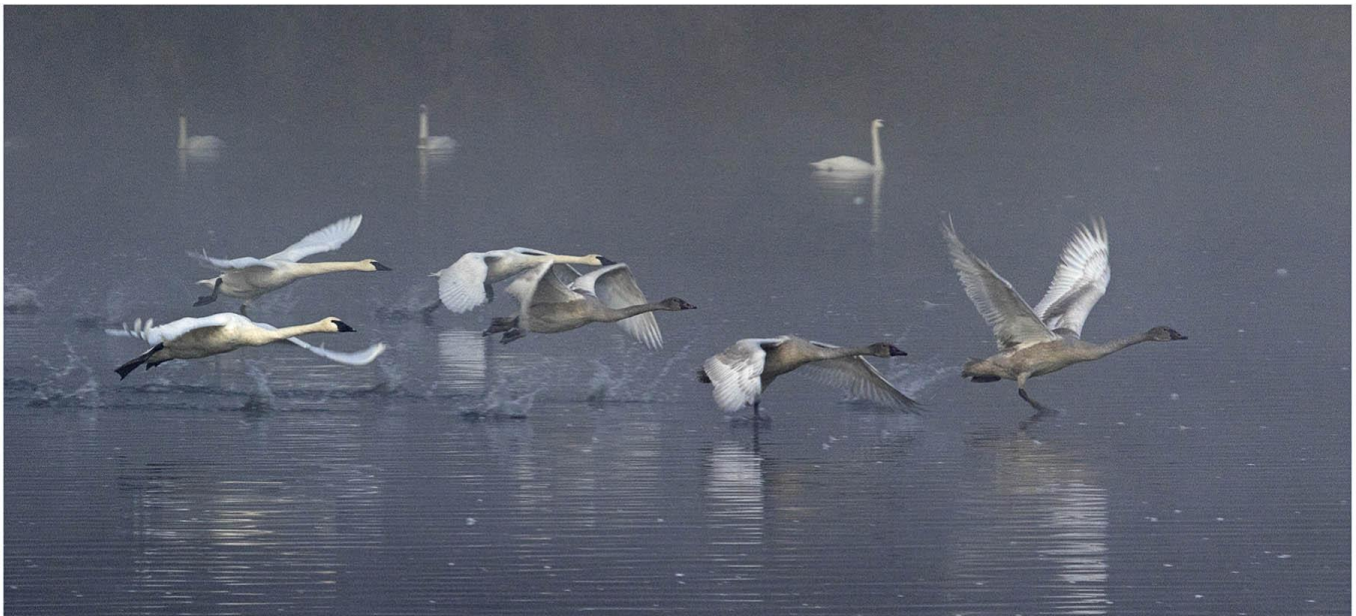
Swans Taking Off To Fly - Renata Kleinert