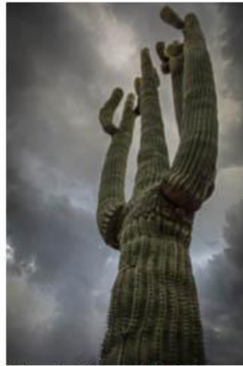
Hands Up - Bill Schwarz