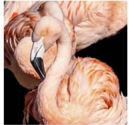
Flamingos - Bill Schwarz