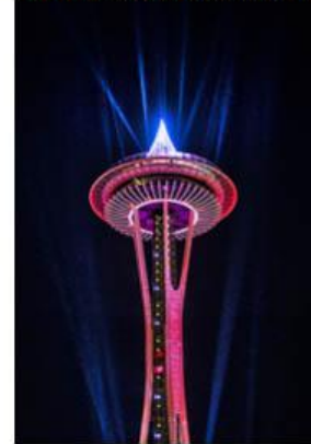
Light Show-Sharon Ely