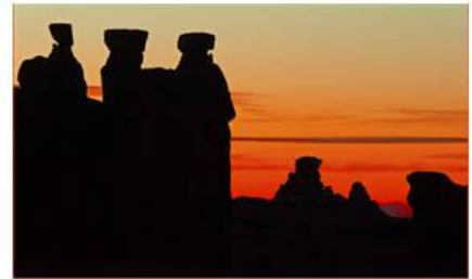
Three Gossips - Renata Kleinert