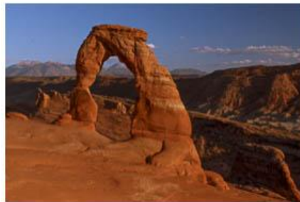
Delicate Arch - Steve Lightle