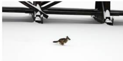
Coyote Ugly-Donna Branscome