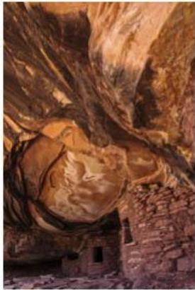
Falling Roof House - Bill Schwarz