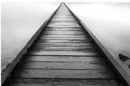
Continue Forward-sonya lang