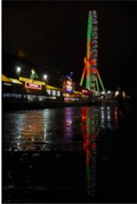
Seattle Wheel2-sonya lang