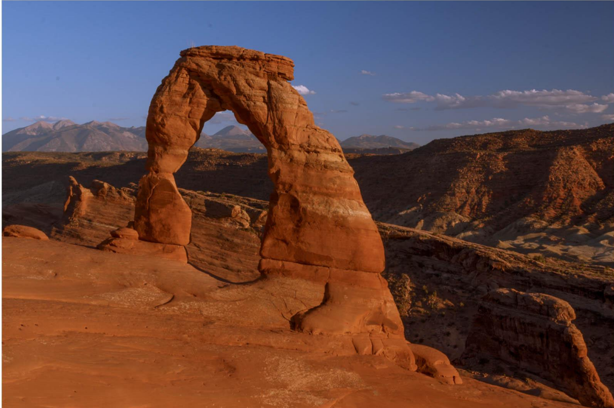
Delicate Arch - Steve Lightle