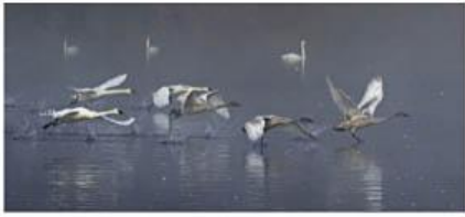
Swans Taking Off To Fly - Renata Klei