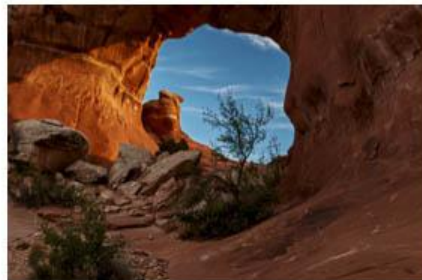
Broken Arch #2 - Steve Lightle