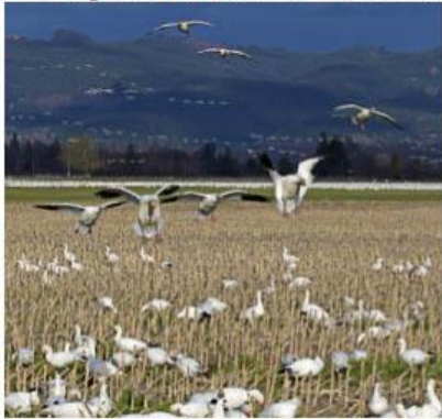
Snow Geese Coming In - Renata Kleinert