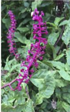
End of Eastern Summer - Sonia Rahm