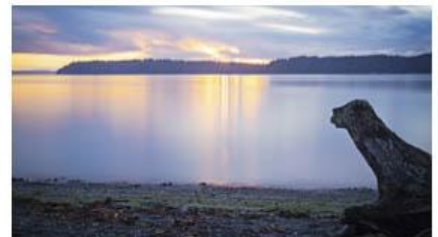
MUK Beach Sunset