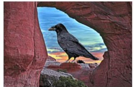
Raven At Broken Arch - Renata Klein