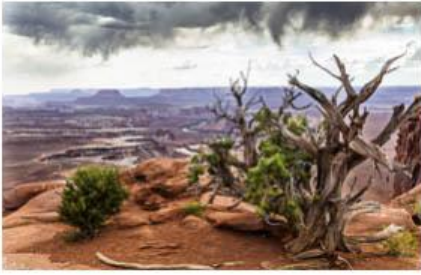
Green River Overlook - Bill Schwarz