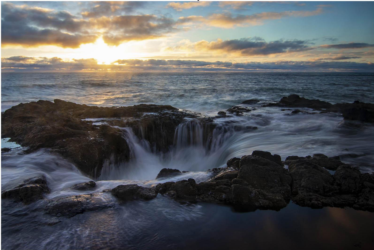
Thors Well - Tracy Carson