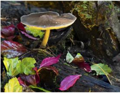
Mushroom - Bill Schwarz