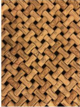
Corks - Dell Deierling