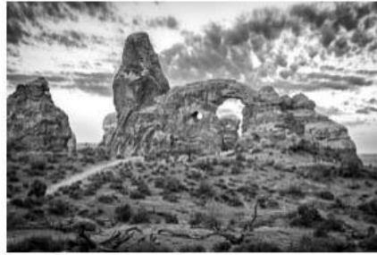
Turret Arch-Sonya Lang