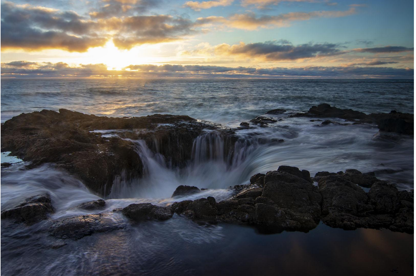
Cover Image: Thor's Well

All images in the newsletter are property of the photographer and all rights are reserved.