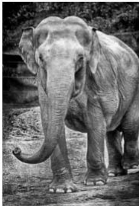
Gorgeous Old Girl-Sonya Lang