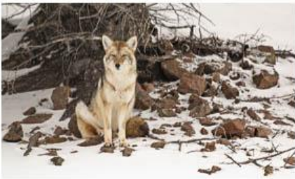
Yellowstone Coyote - Tracy Carson