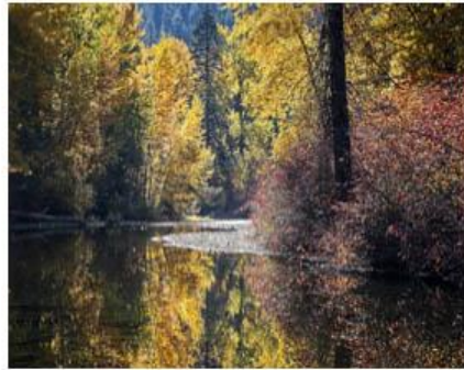
Nason Creek Fall Colors