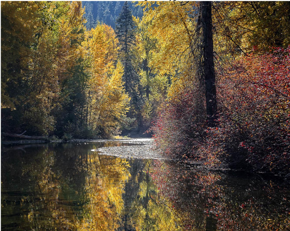
Nason Creek Fall Colors