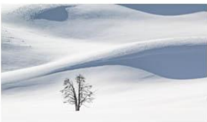
Solitude - Tracy Carson