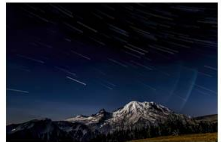
Shock Wave-Lee Dygert