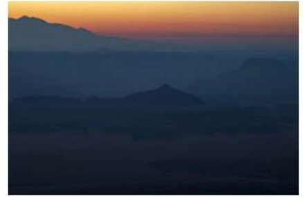
Utah Sunrise-Sonya Lang