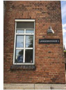
Copenhagen street - Patricia Garrison