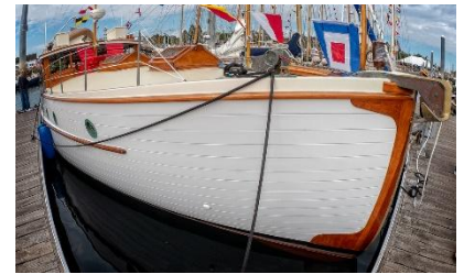
"Your Ship Awaits"