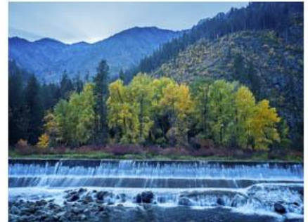
Wenatchee River Damn with Fall Col