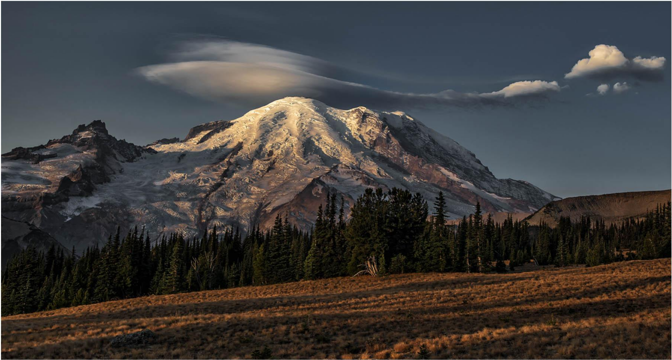
Last Morning-Lee Dygert