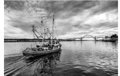
"Kylie Lynn Newport Oregon"