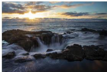
Thors Well - Tracy Carson