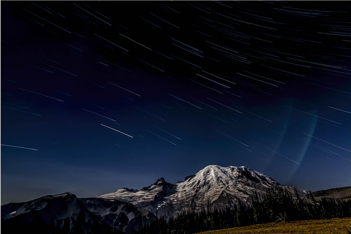
Shock Wave-Lee Dygert