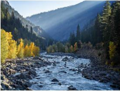
Tumwater Canyon in Fall Colors - Gre