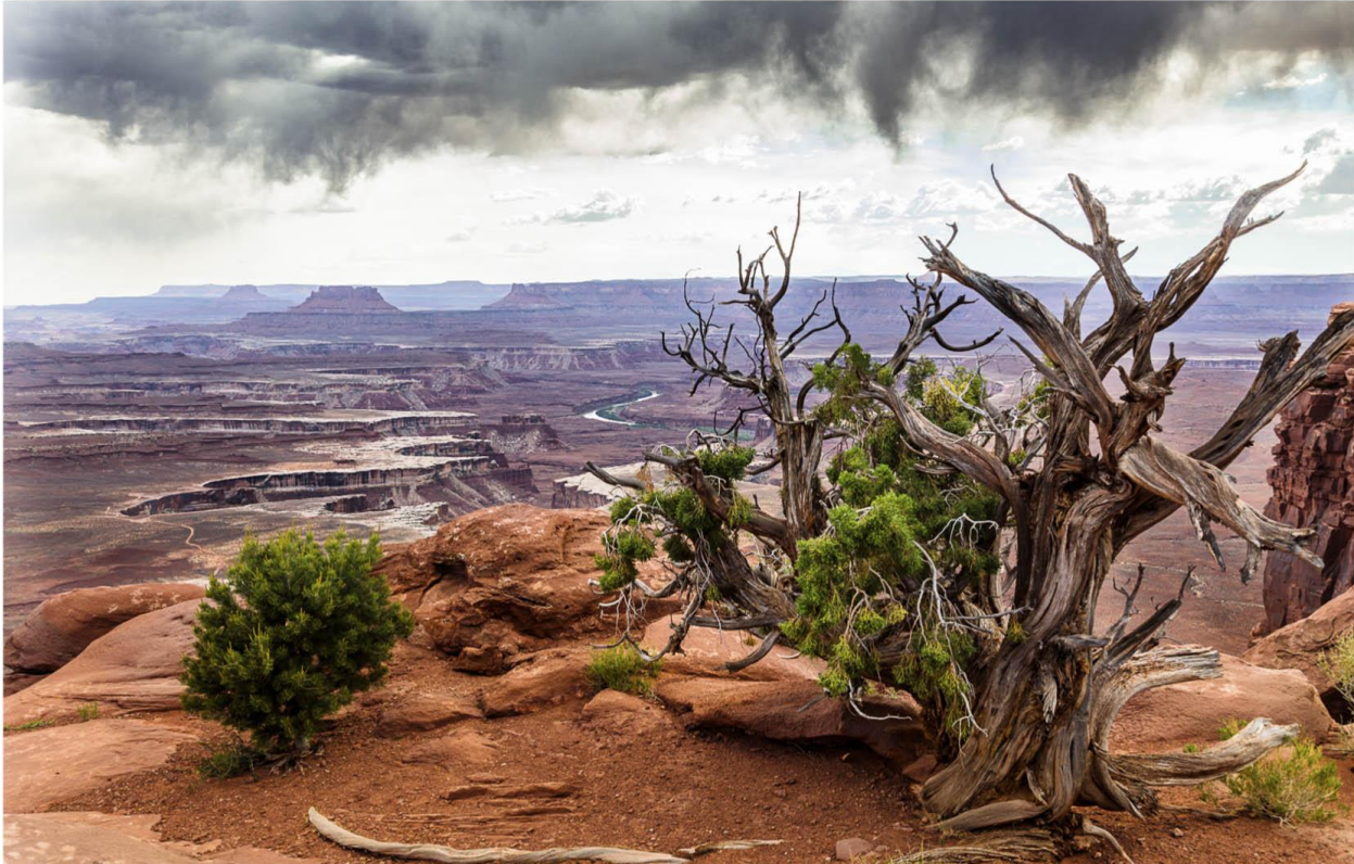
Green River Overlook - Bill Schwarz