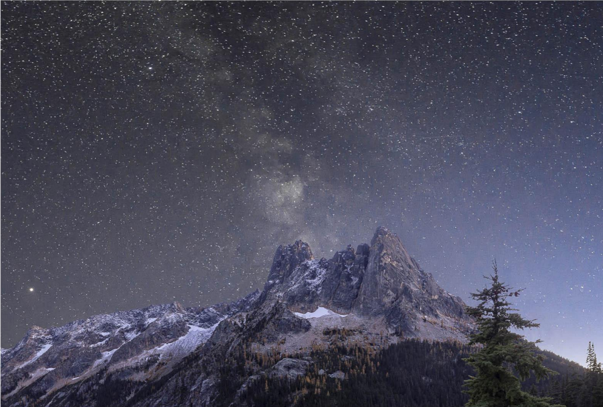
Liberty Bell 1 - Doug Goodman.jpg