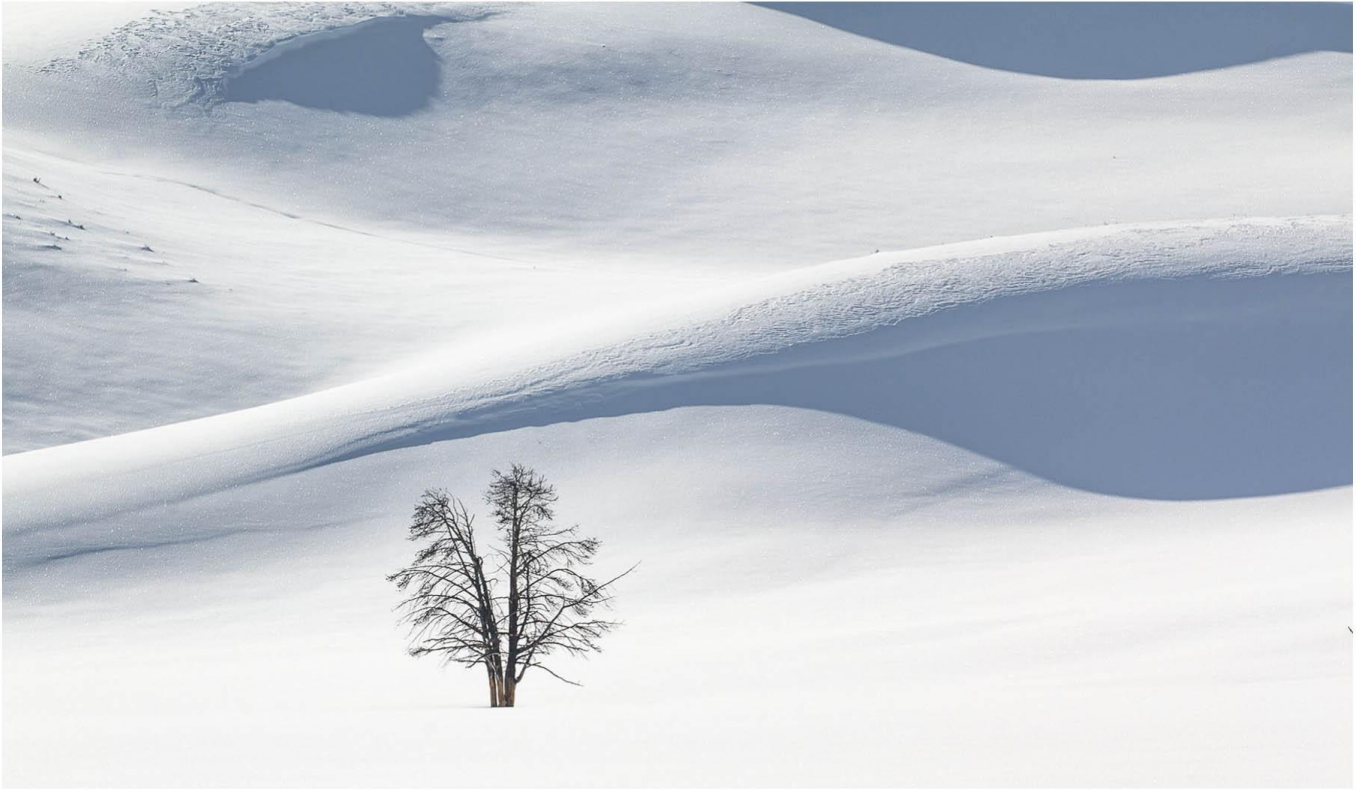
Solitude - Tracy Carson