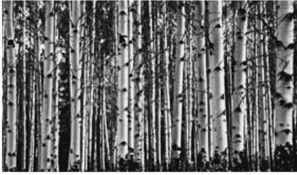
Aspen - Bill Schwarz