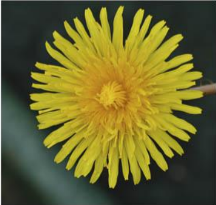
Pretty in Yellow - Sonia Rahm