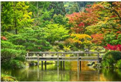
Japanese Gardens - Renata Kleinert