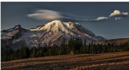
Last Morning-Lee Dygert