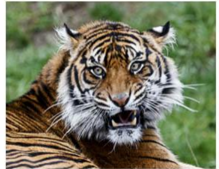
Kirana, Sumatran Tiger - Steve Light