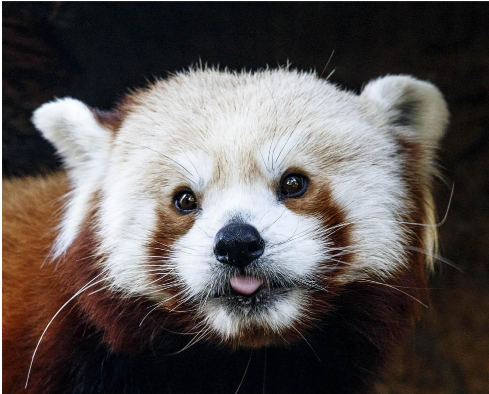
Carson, Red Pandas