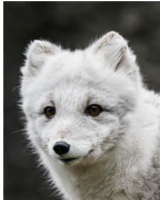
Scout, Arctic Fox - Steve Lightle