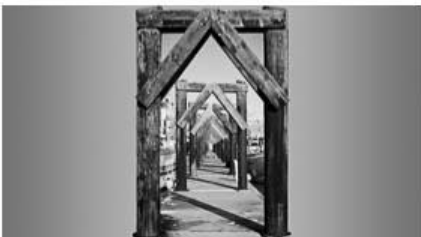
Marina Tunnel