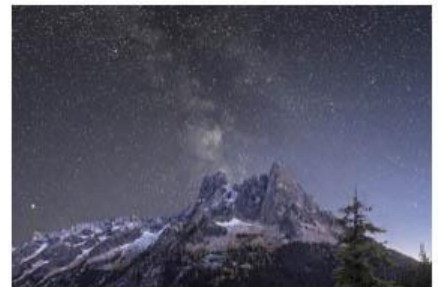
Liberty Bell 1 - Doug Goodman.jpg