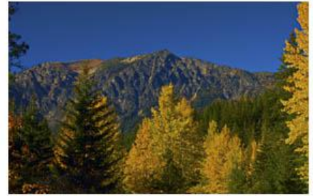
Icicle Canyon Colors-Sherrie Tallman