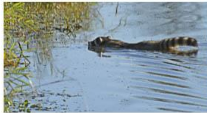
Racoon Swimming