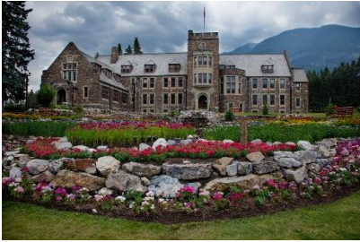
"Banff Cascade Gardens"