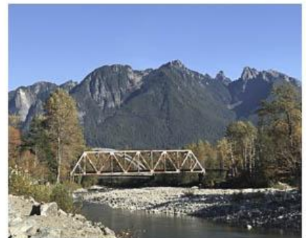
Train Trestle at Index - Sonia Rahm