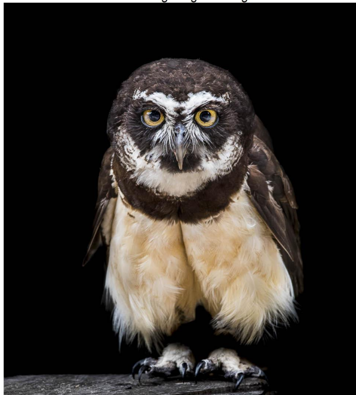
Spectacled Owl - Paul Priebe