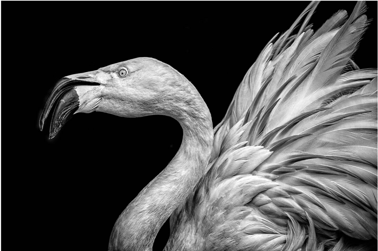
Shapely Mingo-Sonya Lang