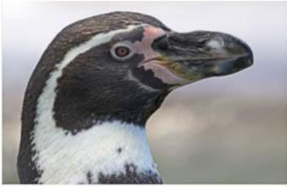
Humboldt Penquin - Renata Kleinert