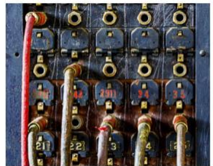
Switchboard - Steve Lightle