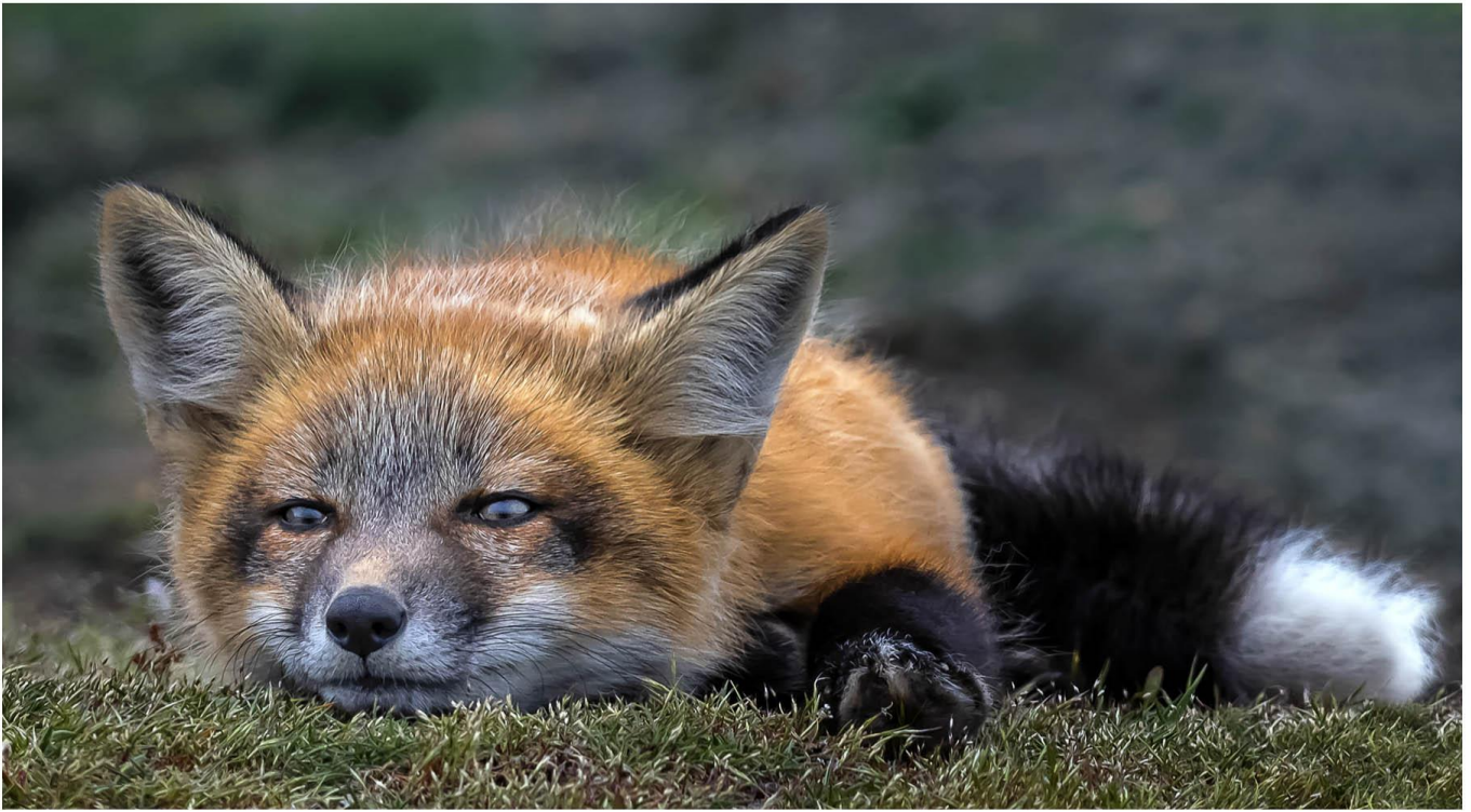
Oh Bother-Lee dygert