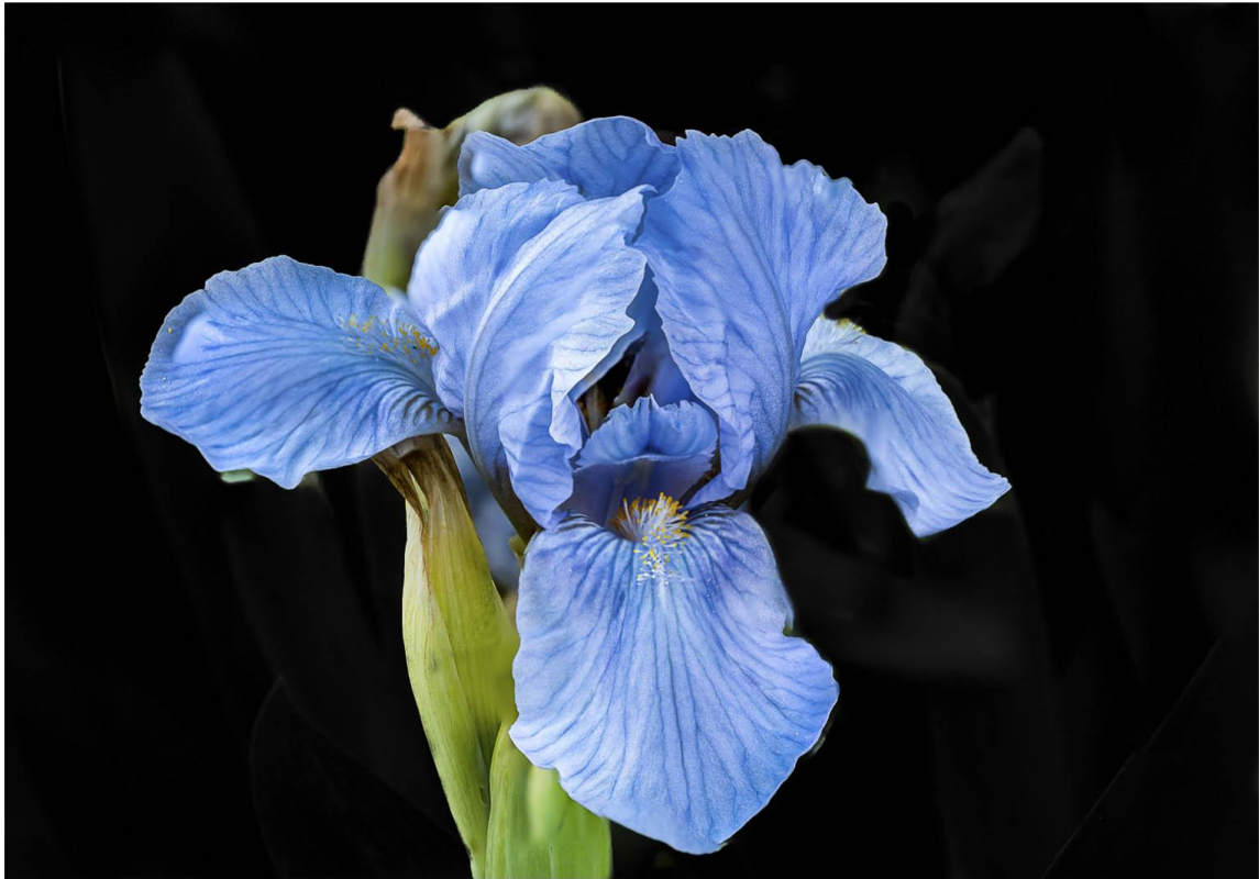
Dwarf Blue Iris reg images - Greg Thomas