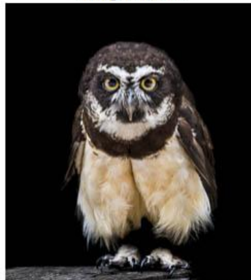
Spectacled Owl - Paul Priebe