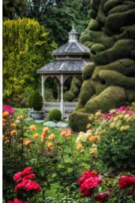
Rose Garden Glow-Sonya Lang