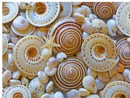
Shell Patterns -Renata Kleinert