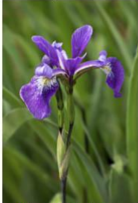
Iris - Bill Schwarz