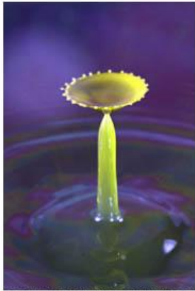
DROP 2-JIM BASINGER