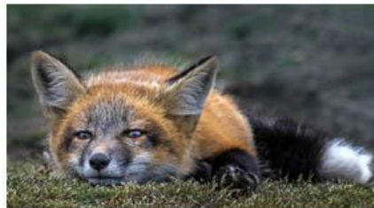
Oh Bother-Lee dygert