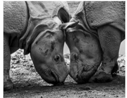
When Push Comes To Shove - Steve Lightle