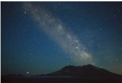
Mt St Helens Milky Way