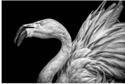
Shapely Mingo-Sonya Lang