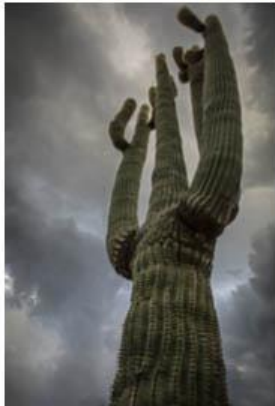
Hands Up - Bill Schwarz