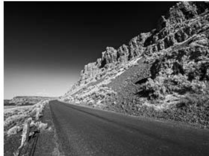
Vantage Road Cliffs reg images - Greg Thomas