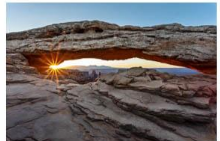
Mesa Arch Sun Burst - Bill Schwarz