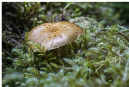
Mushroom Macro