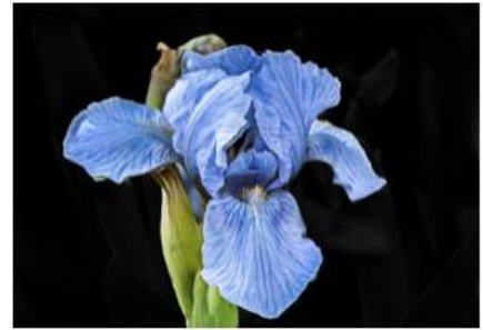
Dwarf Blue Iris reg images - Greg Thomas