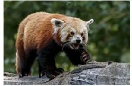
Red Panda