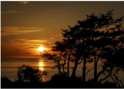
Fort Casey Sunset reg images - Greg Thomas