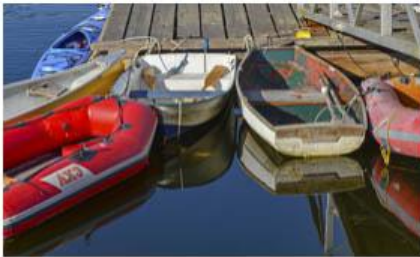
Dinghies at Dock - Jennie Bouma