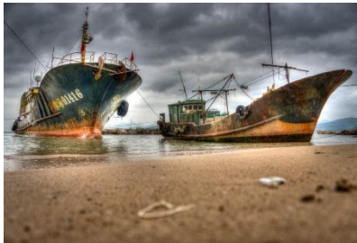
"China Ships"