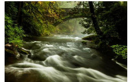
"Whatcom Creek"