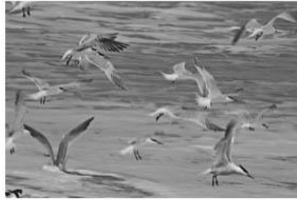
ROYAL TERNS-JIM BASINGER