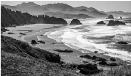
Crescent Beach - Bill Schwarz