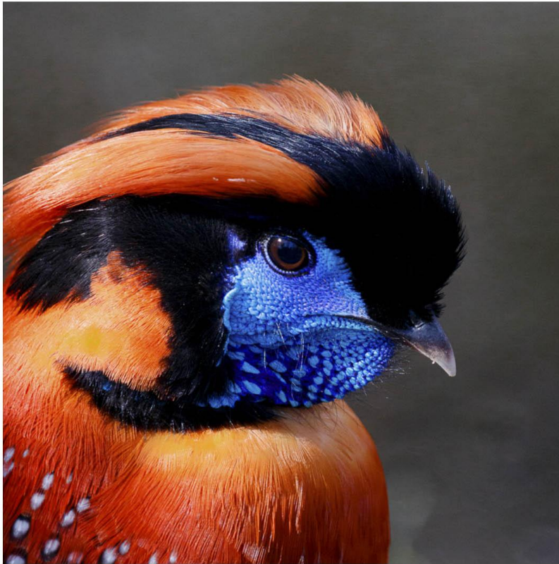
Temminick's Tragopan