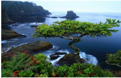
"Cape Flattery Bonsai"