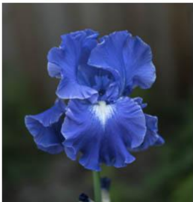
Blue Iris- Paula Kelley