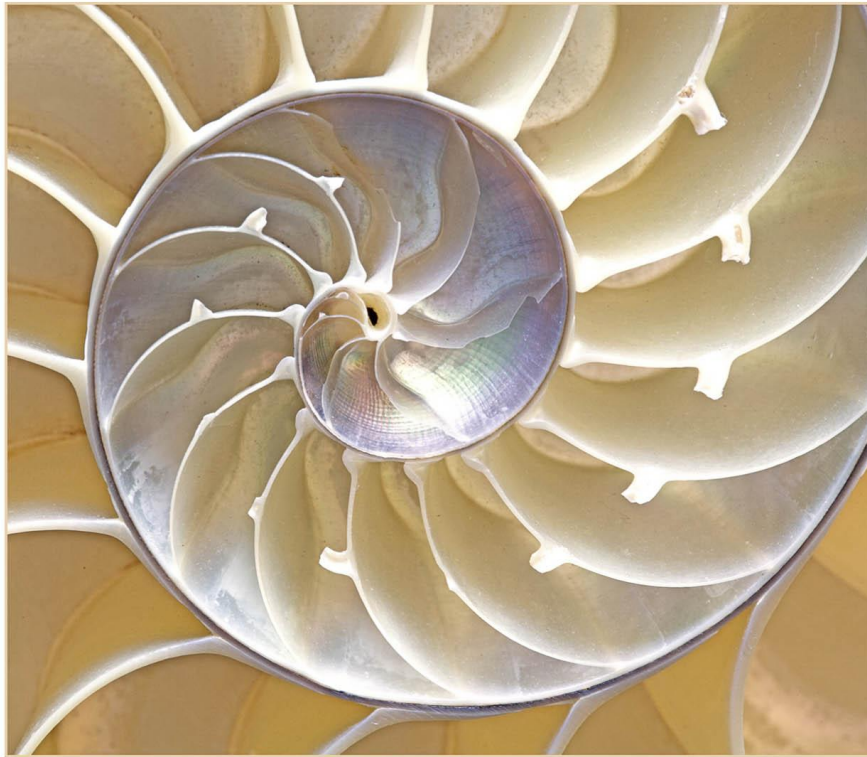
Sea Shell-Renata Kleinert