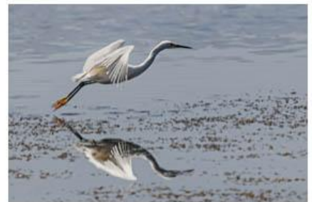
Snowy Egret In Flight - Steve Lightle