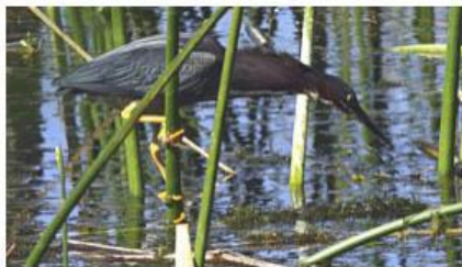
Glossy Ibis #2