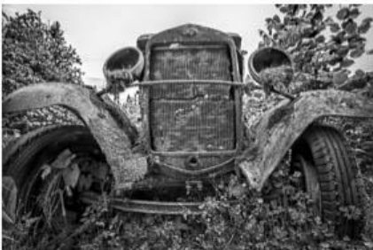
Ford Power-sonya lang