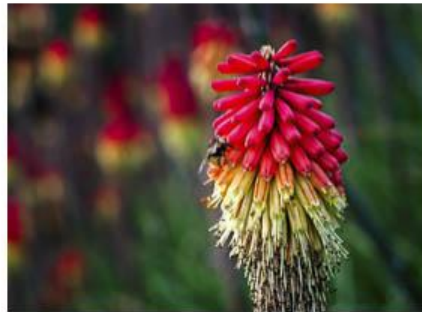
Indian Paint Brush and a Bee - Greg