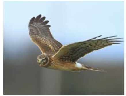
NORTHERN HARRIER-JIM BASINGER