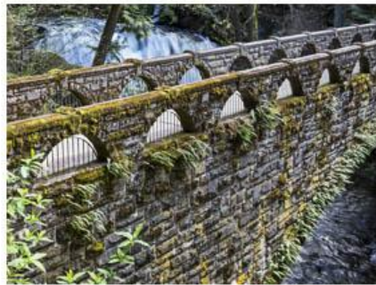
Whatcom Falls Bridge - Bill Schwarz