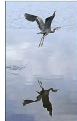
Blue Heron-Jim Rahm