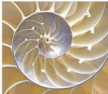
Sea Shell-Renata Kleinert