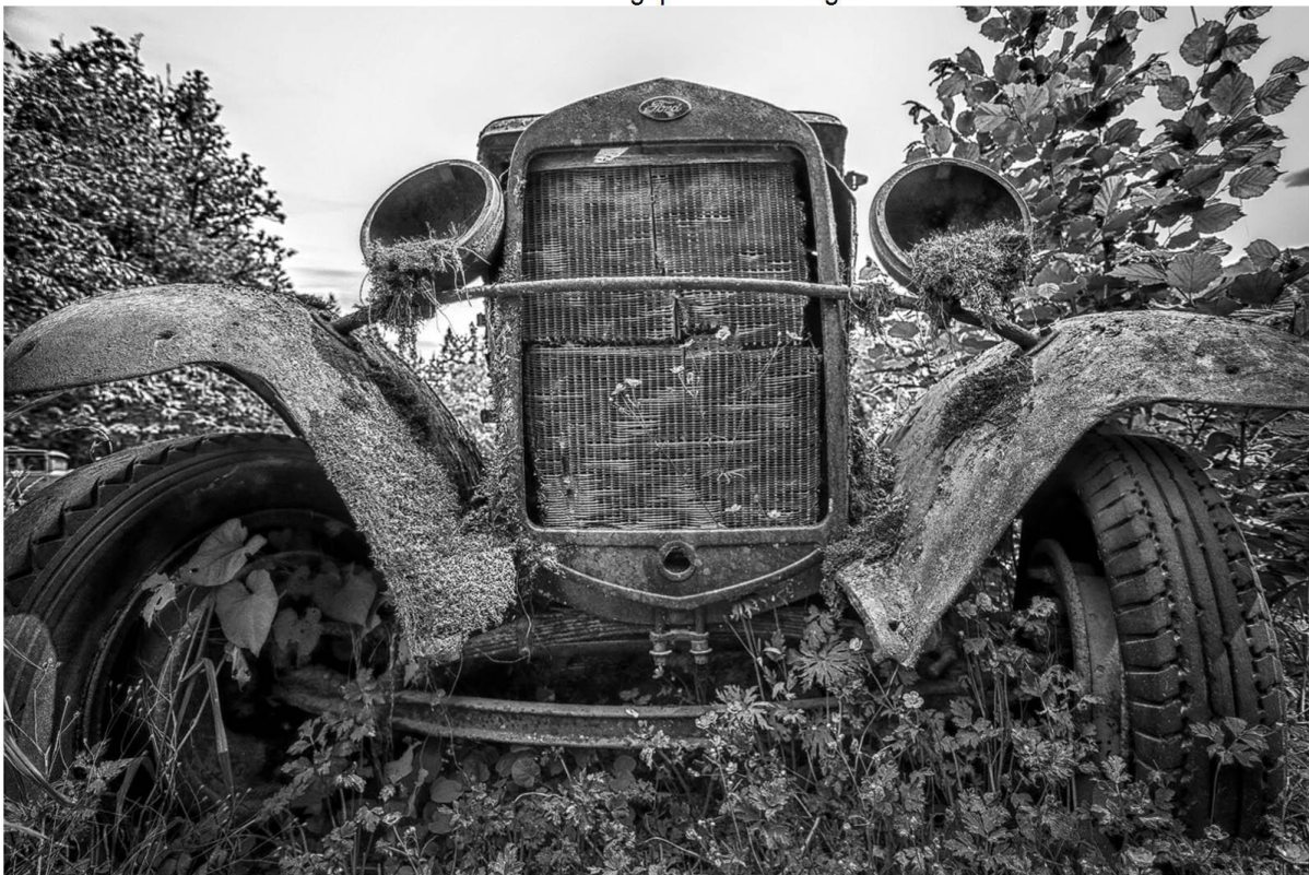
Ford Power-sonya lang