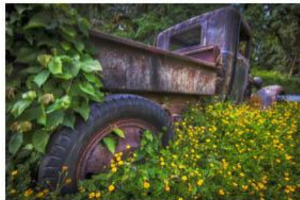
Garden Ford-sonya lang