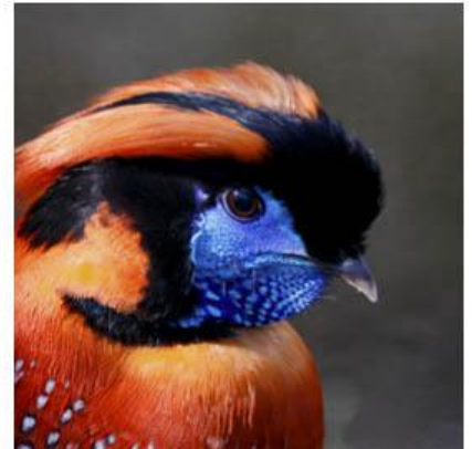
Temminck's Tragopan - Steve Lightle