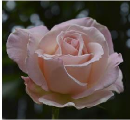
Soft Pink Climing Rose - Sonia Rahm