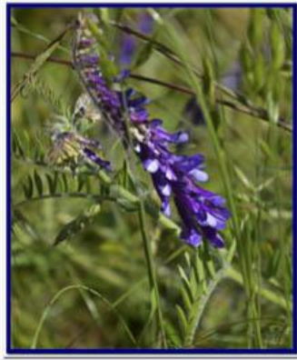
Purple Wildflower - Sonia Rahm