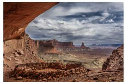
False Kiva - Bill Schwarz