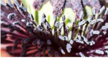
Abstract-Paula Kelley jpg