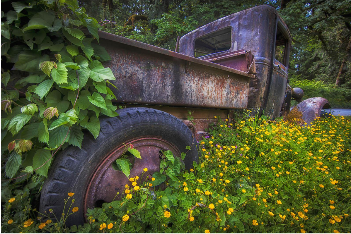
Garden Ford-sonya lang