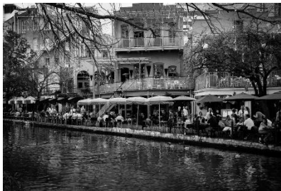
"Riverwalk San Antonio"