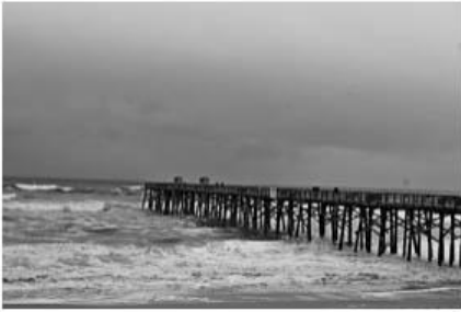
FLAGLER PIER-JIM BASINGER