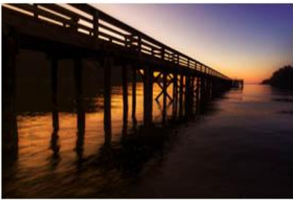
Bowman Bay Sunset Dock - Sonya L