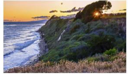
Elwood Bluffs Sunflare - Jennie Boum