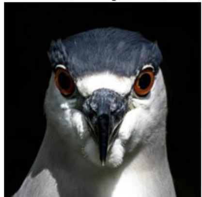
Black Crowned Night Heron - Steve Li