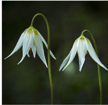
11-One Lily Two-Sonya Lang