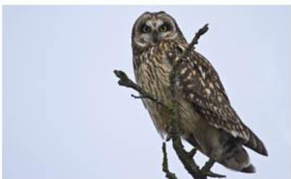
18-Hoo Are You-Sherrie Tallman