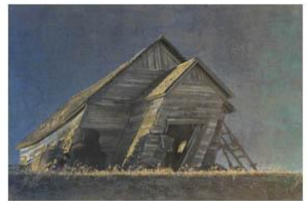
19-Falling into History-Sharon Ely