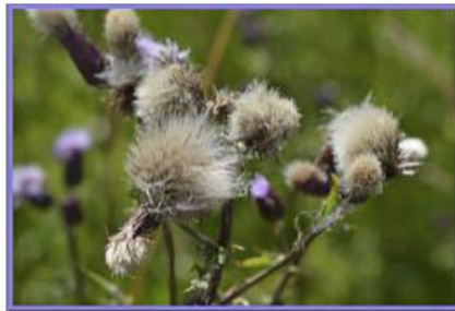
13-Exploding Wildflower - Sonia Rah