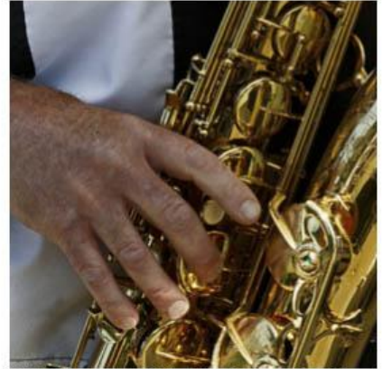
2017 Assigned Subject Working Hand