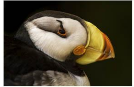
2017 IOY 1st_Horned Puffin_Sharon