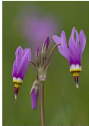
31-Shooting star-Kevin Siefke