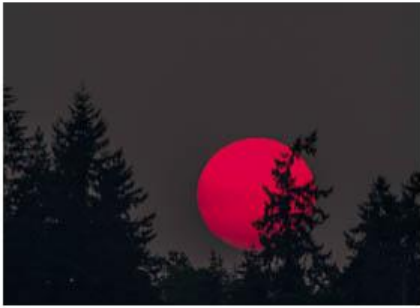
6-Smokey Sunset thru Trees 2 - Greg Thomas