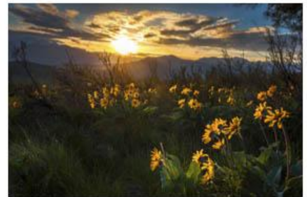
12-Balsamroot at Sunset - Don Elliott