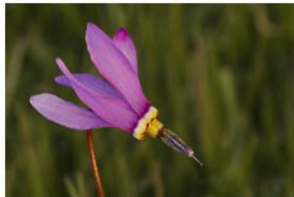
18-Shooting Star 2017 - Steve Lightle