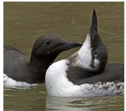
23-Just The Right Spot - Renata Klei