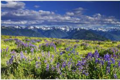
24-Hurricane Ridge Lupines-Sherrie T