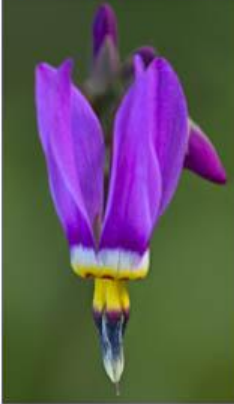
20-Shooting Star - Renata Kleinert