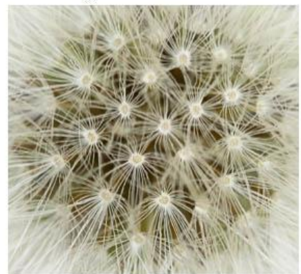
2017 Wildflower 3rd_Seedhead_Kevi