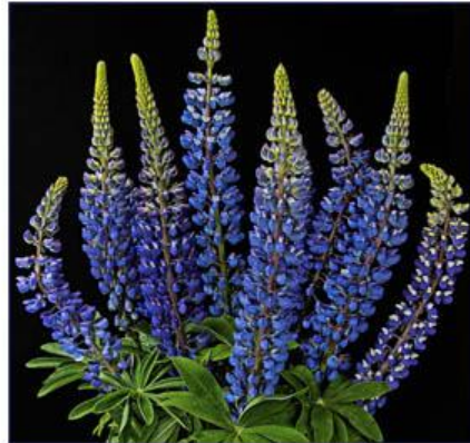
24-Lupin - Renata Kleinert