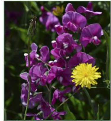
14-Wildflowers two - Sonia Rahm