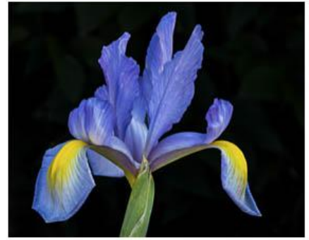
4-Blue Iris in Full Bloom - Greg Thomas