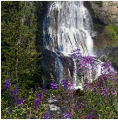
4-Lupine - Bill Schwarz