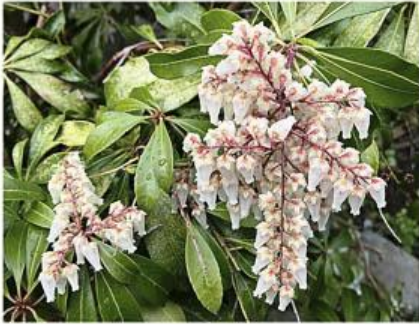
22-Wild Flower - Jim Rahm