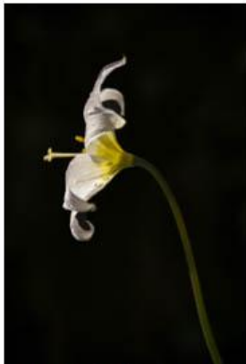
9-Bathed in Light-Sonya Lang