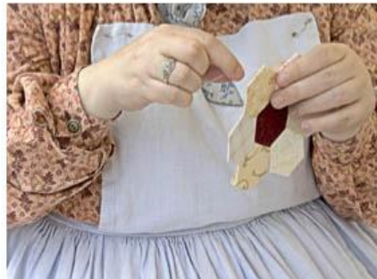
2017 Assigned Subject Working Hand