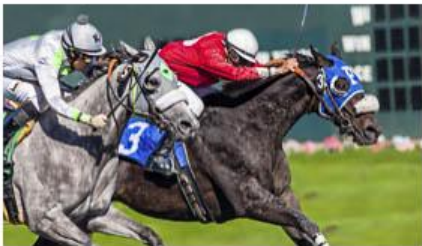
4-Guiding Hands - Bill Schwarz