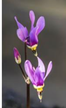
1-Broad Leaf Shooting Star-Paula Kelley