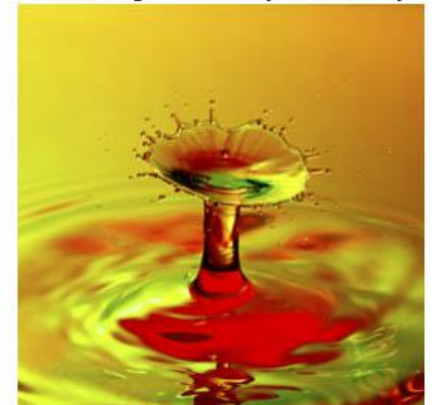
2017 IOY HM_Catch That Small Drop