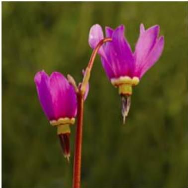
17-Shooting Star 2017 #2 - Steve Lightle