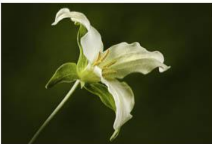
27-Western Trillium-Sharon Ely