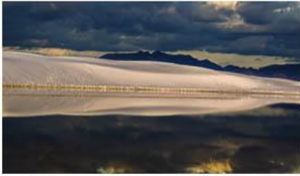
2-Storm Reflection - Bill Schwarz