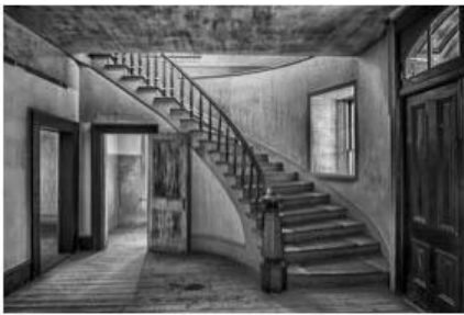
2017 IOY 3rd_Meade Hotel Staircase