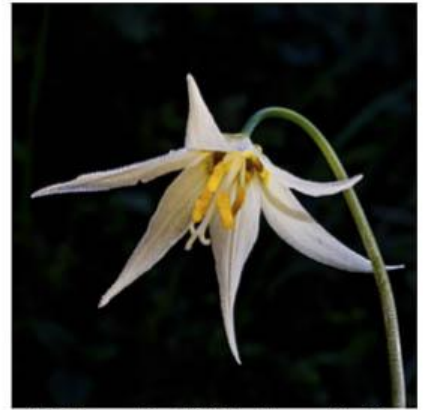
16-Fawn Lily 2017 - Steve Lightle