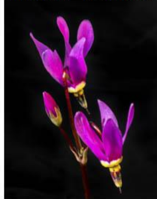
8-Shooting Stars 2 - Greg Thomas