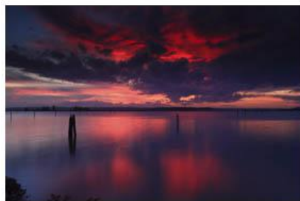
17-One Last Good Sunset-Sherrie Tal