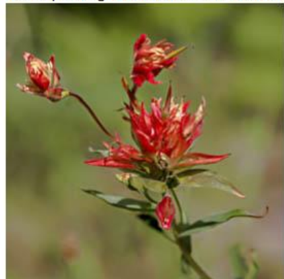
5-Paintbrush - Bill Schwarz