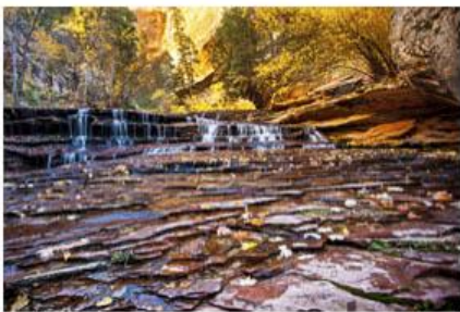
3-Subway Falls - Bill Schwarz