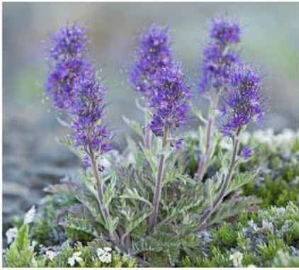
2017 Wildflower HM_Silky Phacelia_