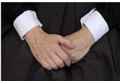
16-The Nun - Renata Kleinert