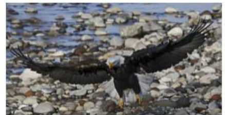
11-Incoming - Steve Lightle