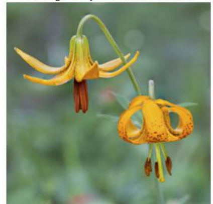
6-Tiger Pair - Bill Schwarz