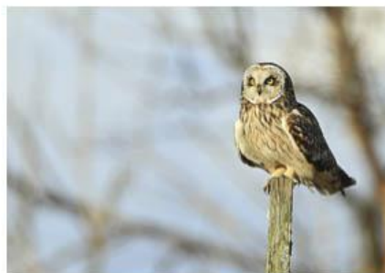
15-SHORT EARED OWL-JIM BASIN