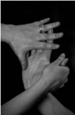
13-Healing Hands Massage - Tracy Carson