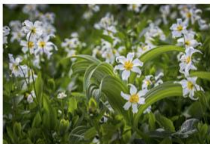
2017 Wildflower HM_Liliy Field_Sony