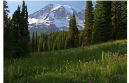
25-Summer on the Mountain-Sherrie