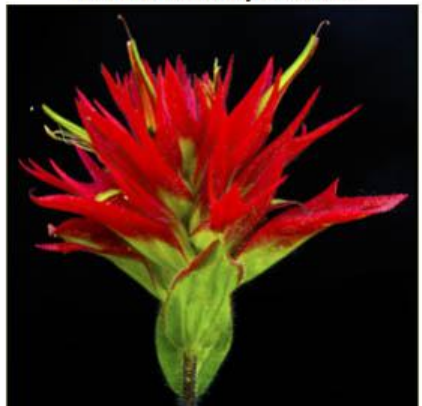
19-Indian Paintbrush - Renata Kleine