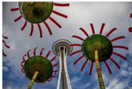
1-Space Needle - Bill Schwarz