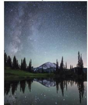
28-Upper Tipsoo-Paula Kelley