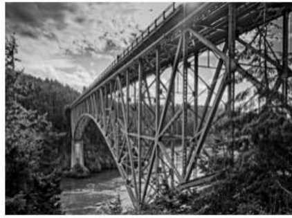
5-High Noon at the Bridge - Greg Thomas