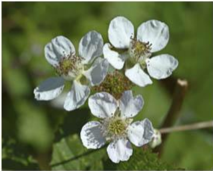
15-Wildflower by 3 -Sonia