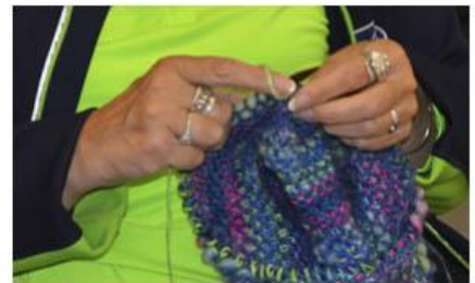
8-Working Hands - Sonia Rahm