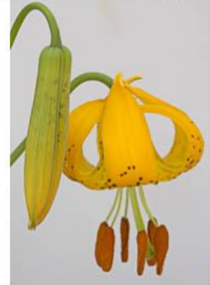
21-Tiger Lily - Renata Kleinert