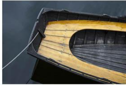
21-Wooden Boat-Sharon Ely