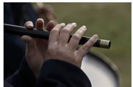
2017 Assigned Subject Working Hand