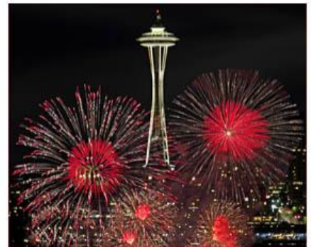
22-Fourth Of July - Renata Kleinert