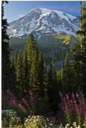
23-Fire Weed-Sherrie Tallman