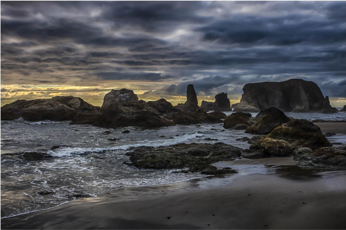
Bandon Beach Sunset - Bill Schwarz