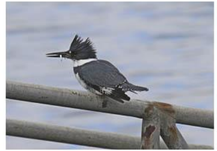
KINGFISHER 2-JIM BASINGER