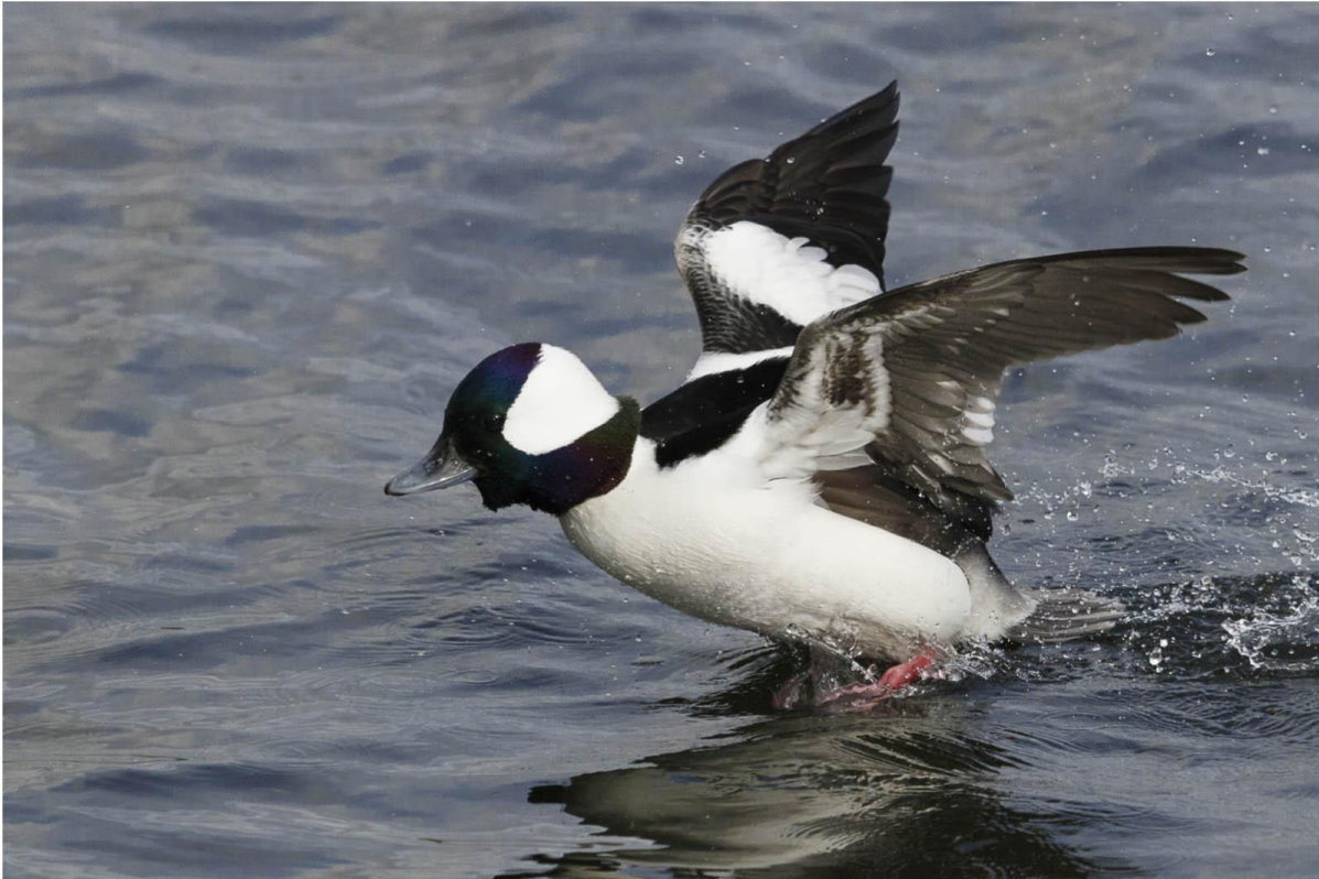
Buffelhead Landing - Steve Lightle