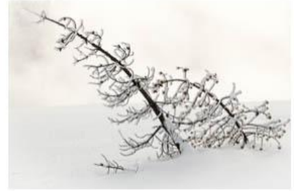
Winters Canvas-Sonya Lang