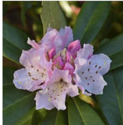
First Rhody at Snoqualmie Falls - Son