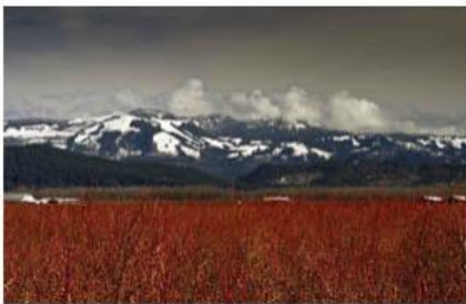
Skagit Valley Blueberry Fields - Sherrie Tallman