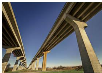
Sunset Perspective - Greg Thomas