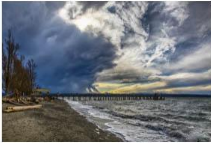
Kayak Point - Bill Schwarz