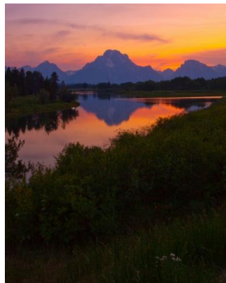
"Sunset At Oxbow Bend"