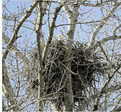
Nesting - Jim Rahm