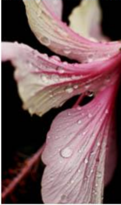
side of hibiscus -Paula Bailly