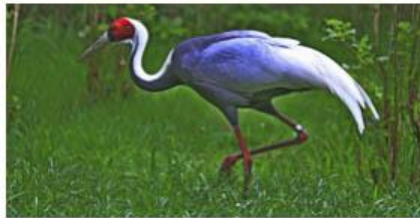
white naped crane