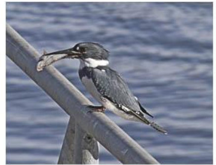
KINGFISHER 1-JIM BASINGER