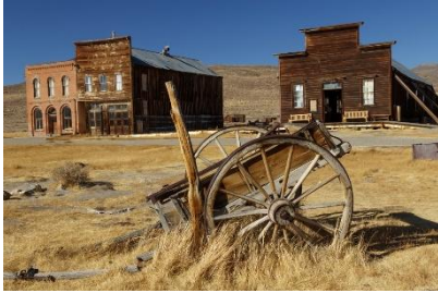
"Bodie Ghost Town"