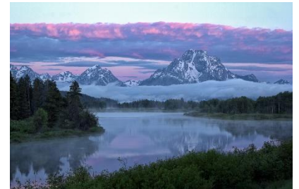
"Tetons From Oxbow Bend"