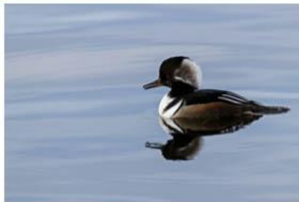
Merganser Reflection