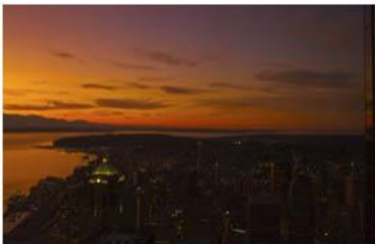
Seattle Sunset - Sherrie Tallman