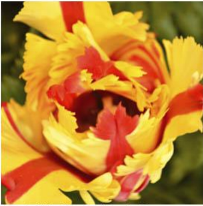
Tulip Flow - Jennie Bouma