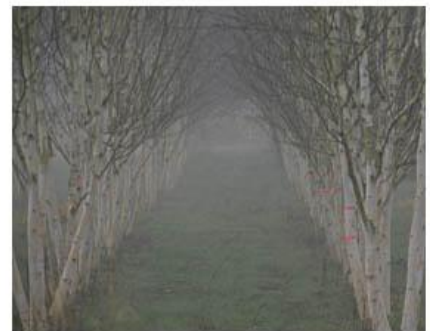
Birch Trees in the Morning Mist- Soni