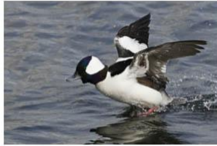
Buffelhead Landing - Steve Lightle