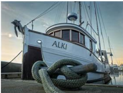
Low Angle Perspective - Greg Thomas