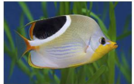
Tropical Fish - Renata Kleinert