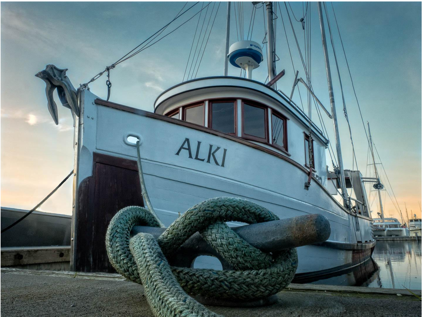
Cover Image: Low Angle Perspective – Greg Thomas

All images in the newsletter are property of the photographer and all rights are reserved.