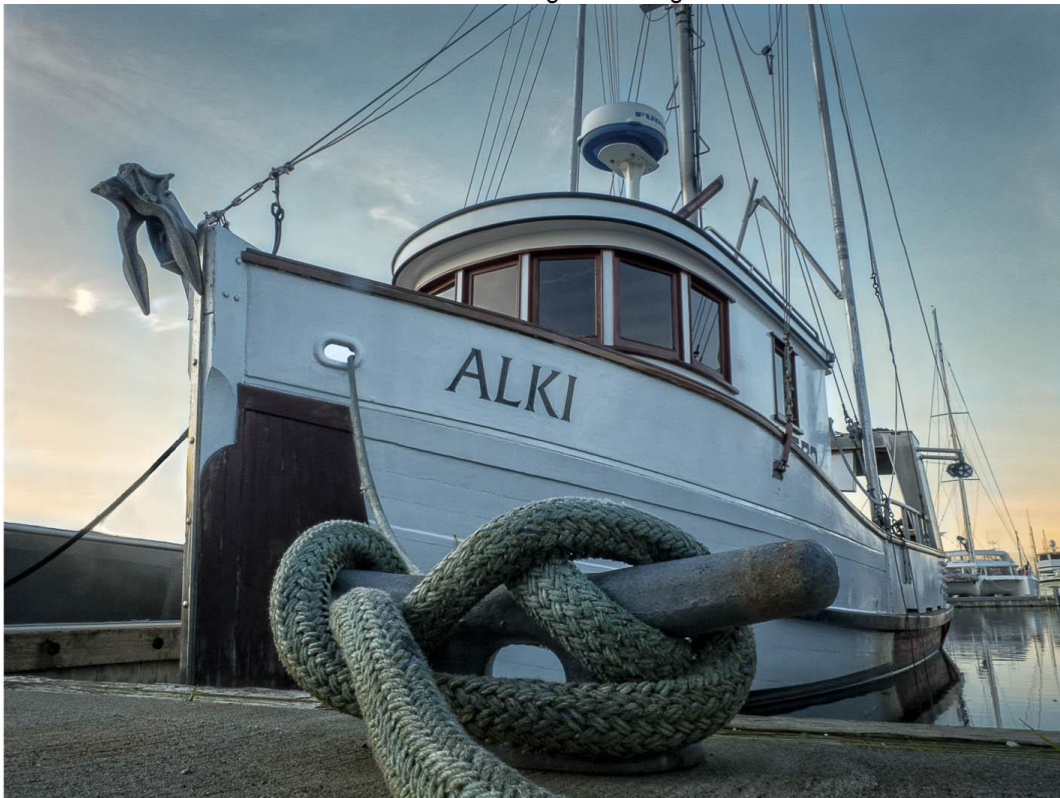
Low Angle Perspective - Greg Thomas