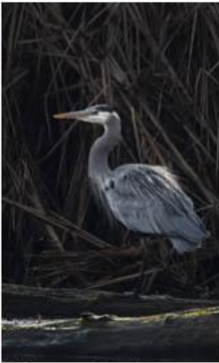
Heron - Bill Schwarz