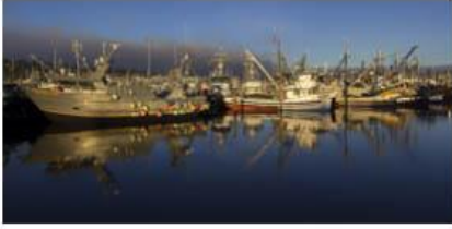
Fisherman's Terminal-Sonya Lang