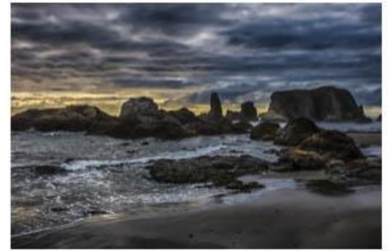
Bandon Beach Sunset - Bill Schwarz