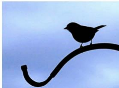
Bird silhouette - Paula Bailly