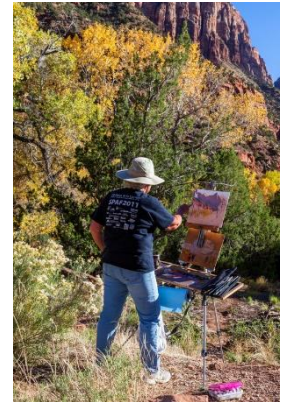
"Painting At Zion"