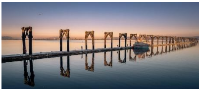
"Sunrise At The Pier"