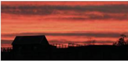
country sunset-Paula Bailly