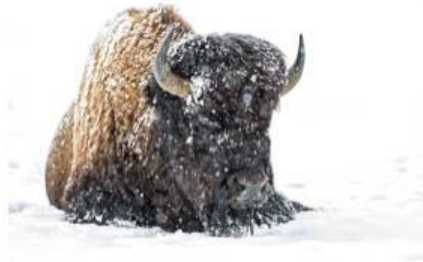
Wintering Bison-Sonya Lang