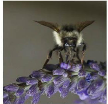
Bee & Lavender - Steve Lightle