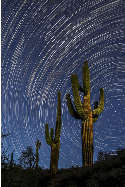
Cactus Star Trail - Bill Schwarz