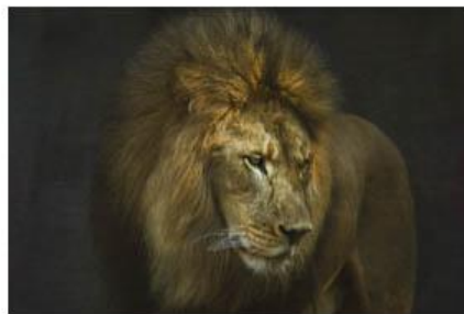
Watchful Eyes-Sharon Ely