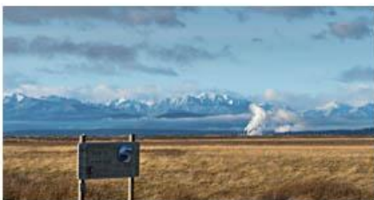
National Historical Reserve reg image