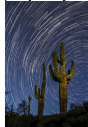
Cactus Star Trail - Bill Schwarz