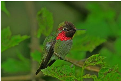
"Anna's Hummingbird"