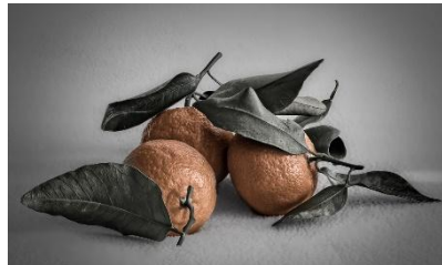
"The Orange Trio" © Greg Thomas