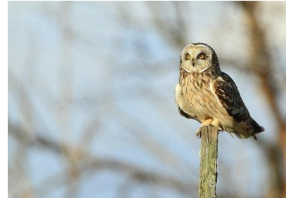
"Short Eared Owl"