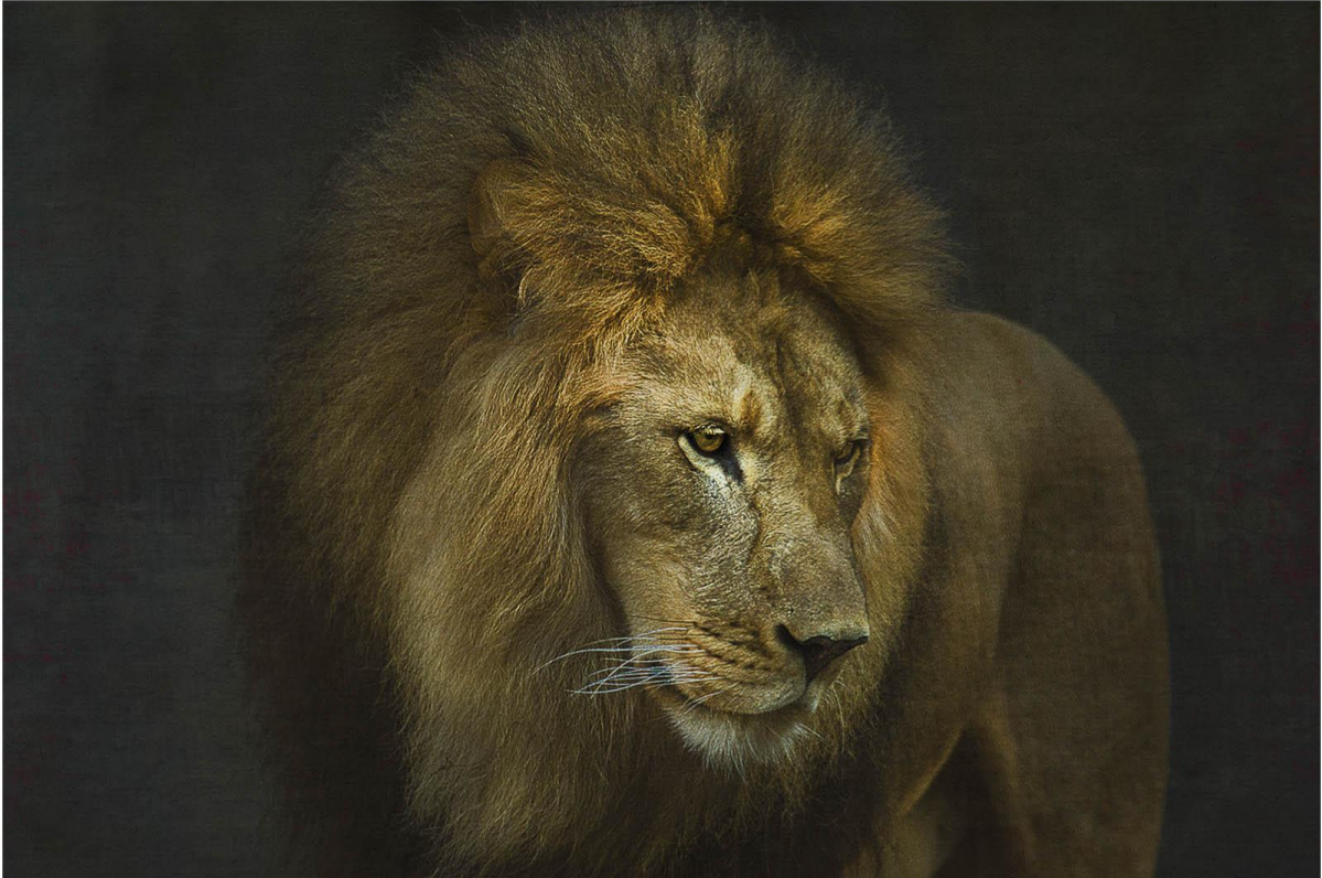
Watchful Eyes-Sharon Ely