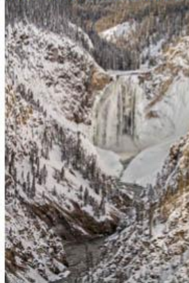
Lower Falls Yellowstone-Sonya Lang