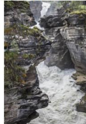
Athabasca Falls - Bill Schwarz