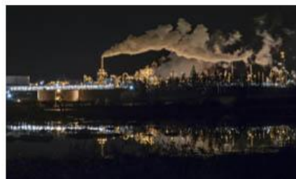
Night Lights and Reflections reg imag