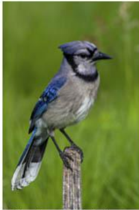
Blue Jay - Bill Schwarz