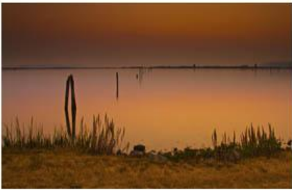
Smoky Summer Sunset-Sherrie Tallm