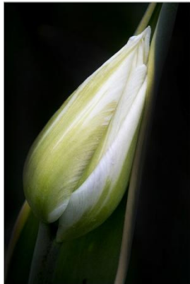
"Praying Tulip" © Sonya Lang