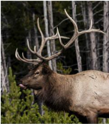
Yellowstone Elk