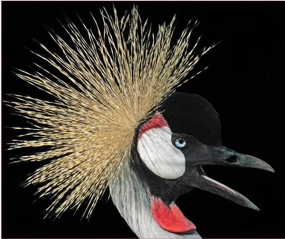
Black Crowned Crane - Renata Kleinert