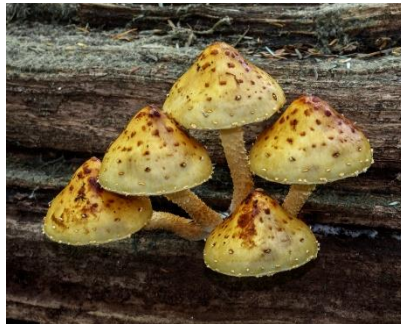
"Mushrooms 5" © Steve Lightle