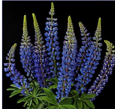
"Lupin" © Renata Kleinert