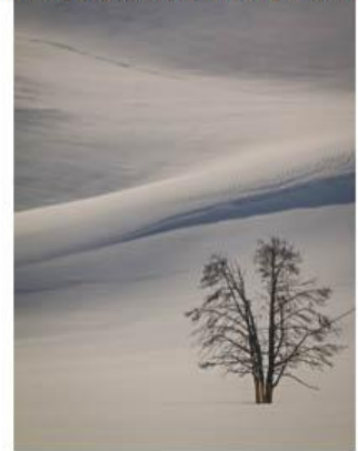
Yellowstone Tree - Tracy Carson