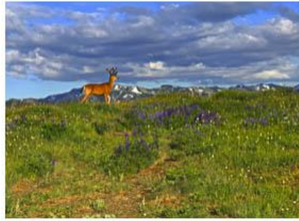
Hurricane Ridge Buck-Sherrie Tallma