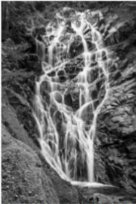
Scenic Creek Falls B&W