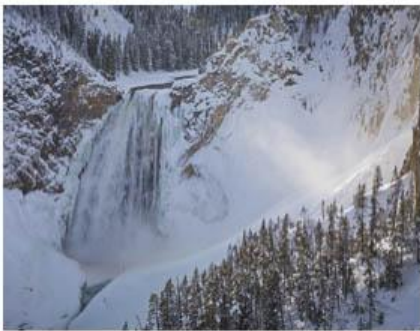
Lower Falls in color - Tracy Carson