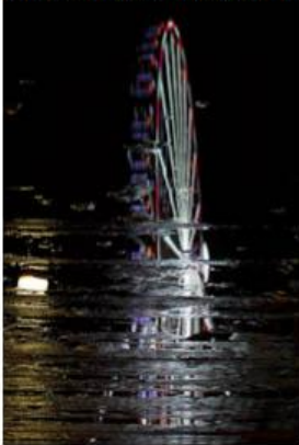
Great Wheel Reflection - Don Elliott