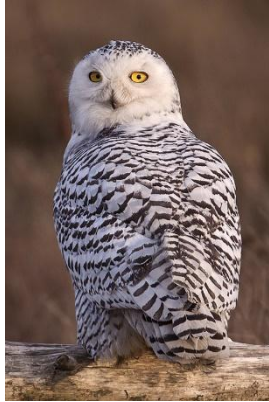
"Looking Back" © Sharon Ely