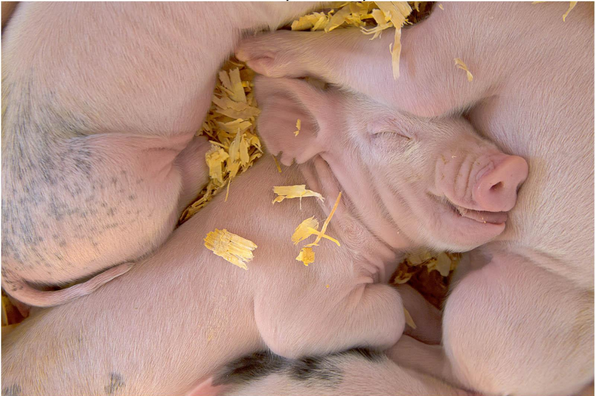
Sweet Dreams - Renata Kleinert