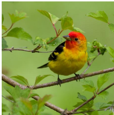
"Tanager" © Bill Schwarz