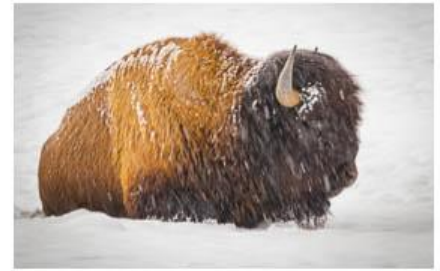
Bison in the snow - Tracy Carson