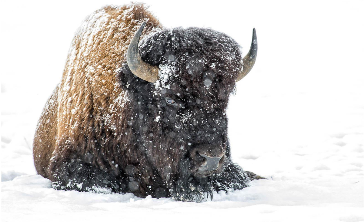
Wintering Bison-Sonya Lang