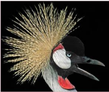
Black Crowned Crane - Renata Klein