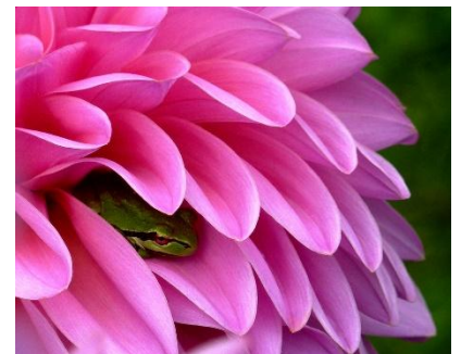
"Tree Frog In Dahlias"