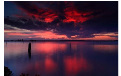
"One Last Good Sunset"