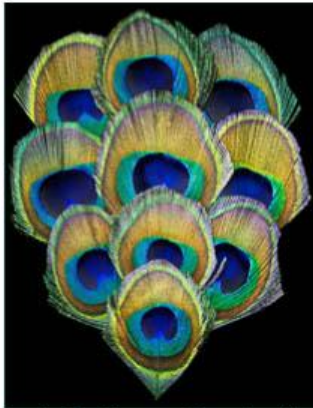
Peacock Feathers - Renata Kleinert