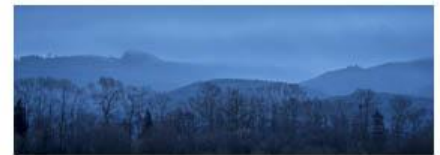
Morning Blue Hour reg images - Greg