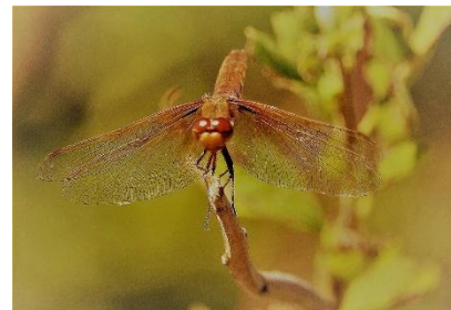
"Very Cool Dragonfly" © Jim Rahm