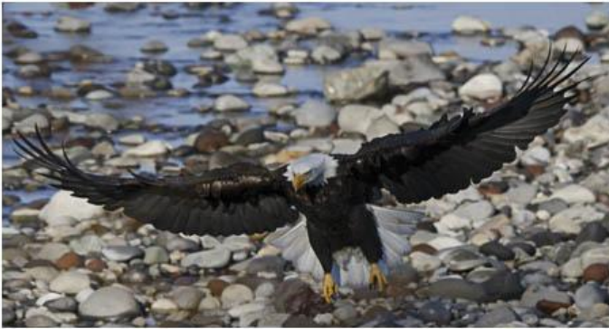
Incoming - Steve Lightle