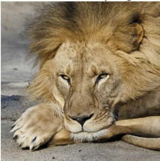
Distrub At Your Own Risk - Steve Lightle