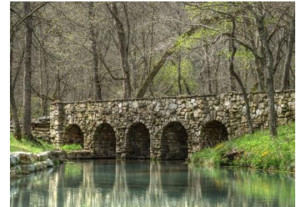
"Dogwood Creek Bridge" © Tim Garton