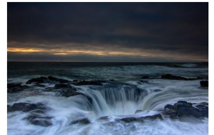
"Thor's Well"