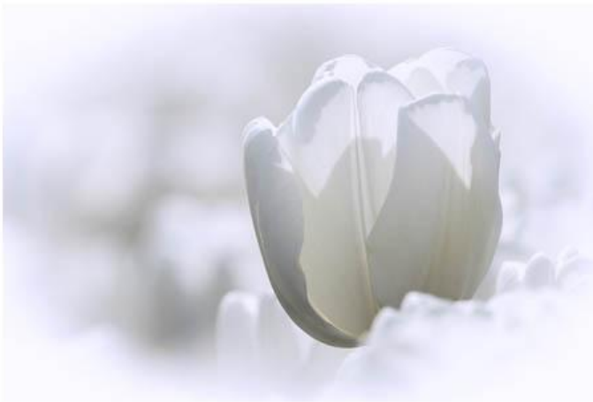
Delicate in White-Sonya Lang