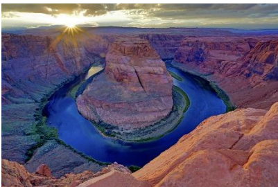
"Horseshoe Canyon" © Renata Kleinert