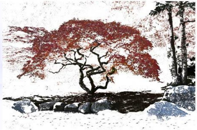
Japanese Maple - Bill Schwarz