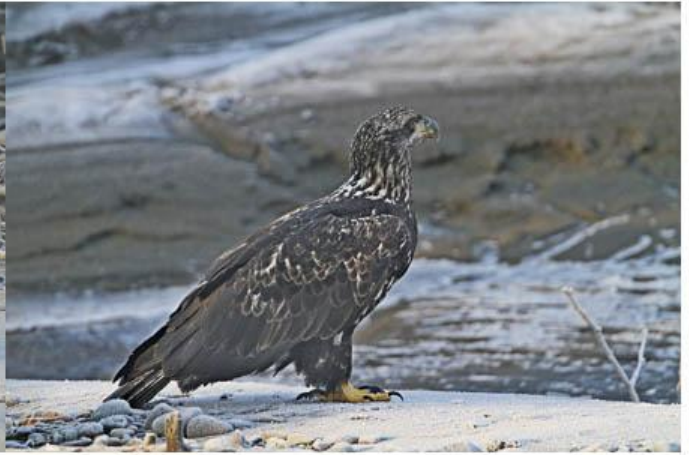
Eagle 2-Jim Basinger