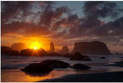
"Bandon Or Sunset"