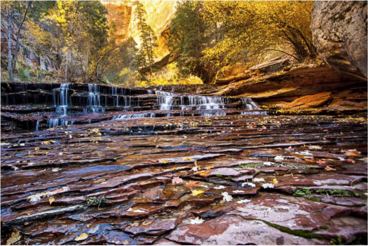
Subway Falls - Bill Schwarz