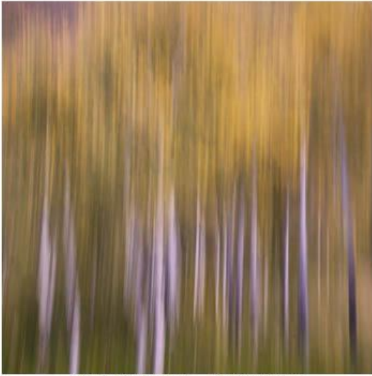
Ghostly Aspen - Bill Schwarz