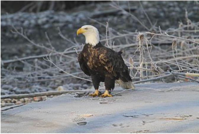
Eagle 1-Jim Basinger