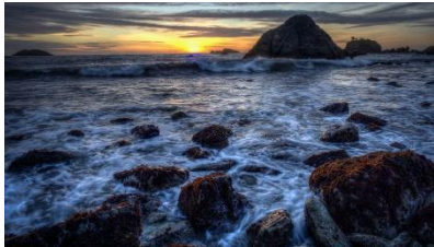
"Crescent City"