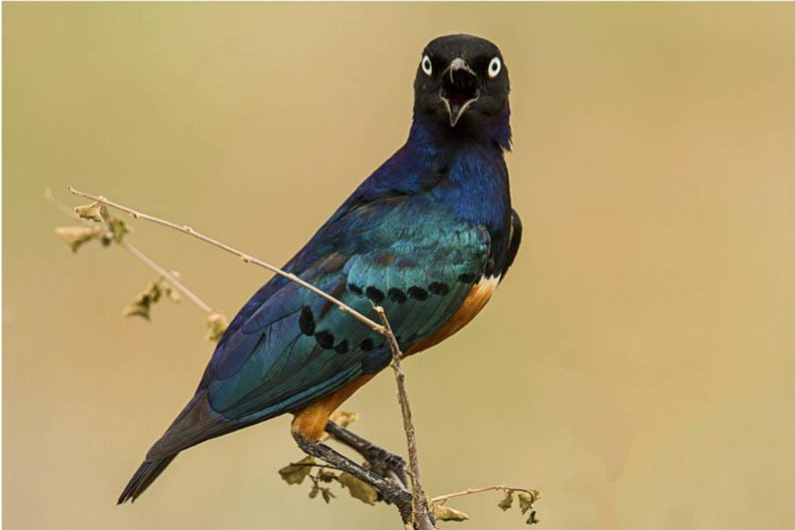
Superb Starling-Sharon Ely