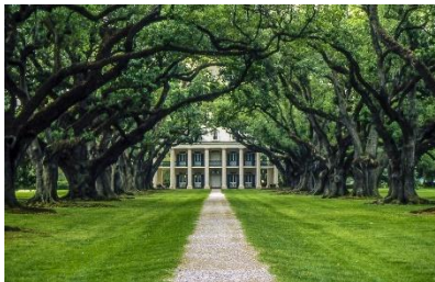
"Oak Alley"