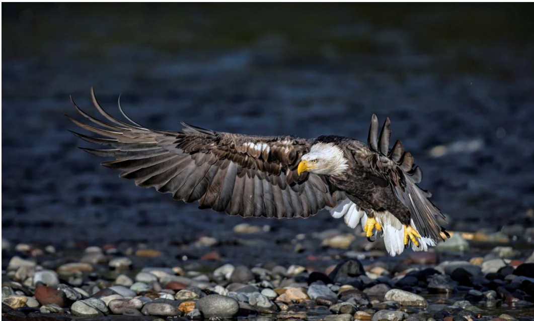
Incoming - Lee Dygert