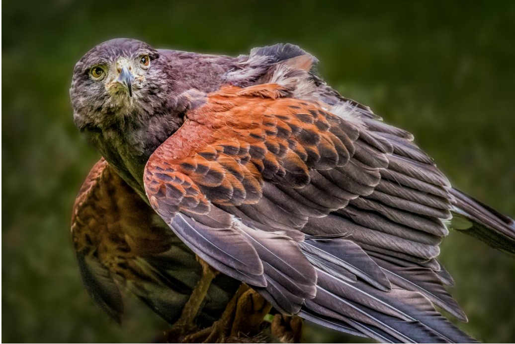
Harris's Hawk