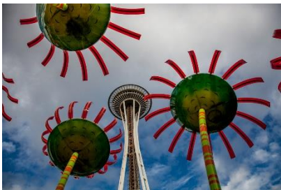
"Space Needle" © Bill Schwarz