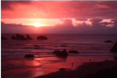
"Bandon Sunset"