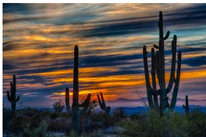
"AZ Sunset" © Bill Schwarz