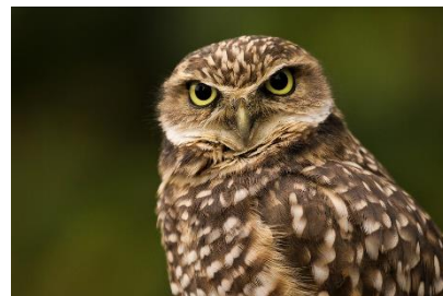
"Here's Looking At You"