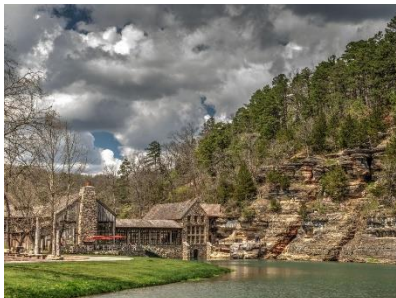
"Dogwood Canyon Mill"