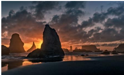
"Fire In The Sky"