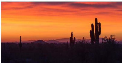
"Cowboy Sunset"