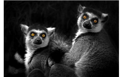
"Ringtailed Lemur Pair" © Sonya Lang