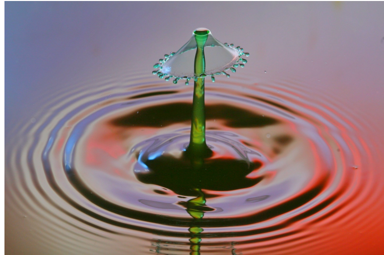
Second Place Water Drop Jim Basinger