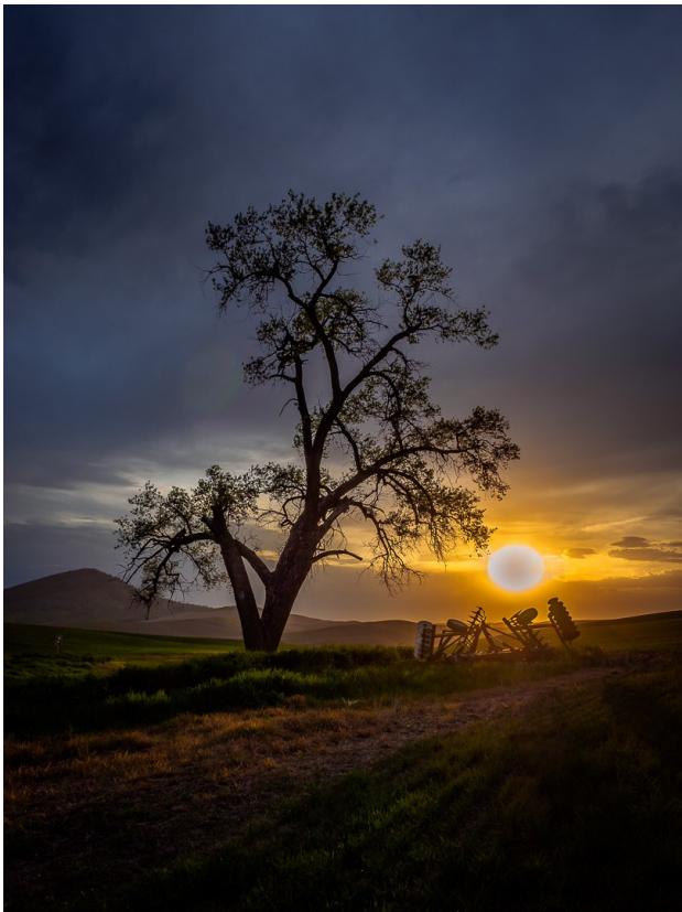
Second Place Lone Tree and Equipment at Sunset 2 Greg Thomas