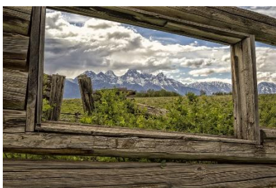
"Tetons From Shane's Cabin" © Sonya Lang