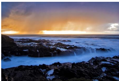
"Cooks Chasm"