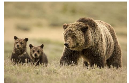
"Yellowstone Family" © Sharon Ely