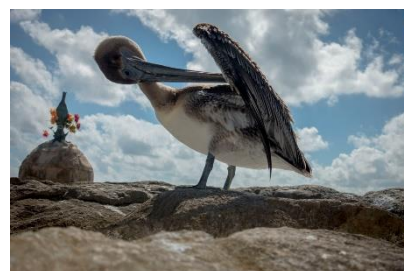
"Tulum Pelican" © Doug Goodman