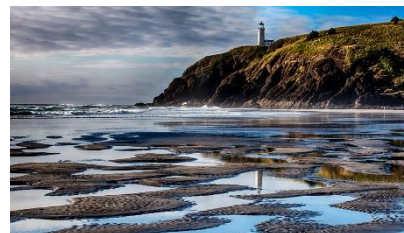
"North Head Lighthouse Washington"