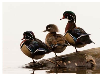
"Wood duck Trio" © Steve Lightle