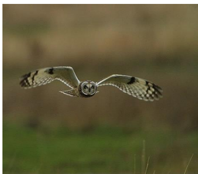
"Short Eared Owl 3"