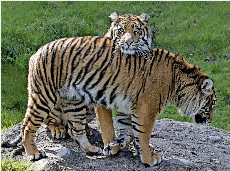
Second Place Tigers Renata Kleinert