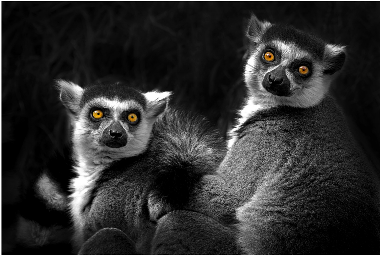
First Place Ring-tailed Lemur Pair Sonya Lang