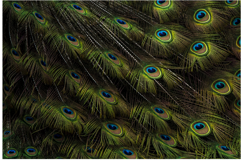
Second Place In Peacock Fashion Sonya Lang