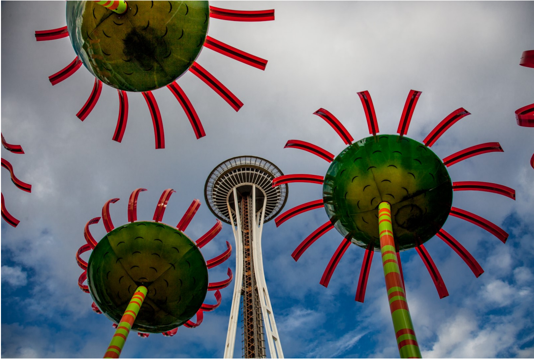
First Place Seattle Bill Schwarz