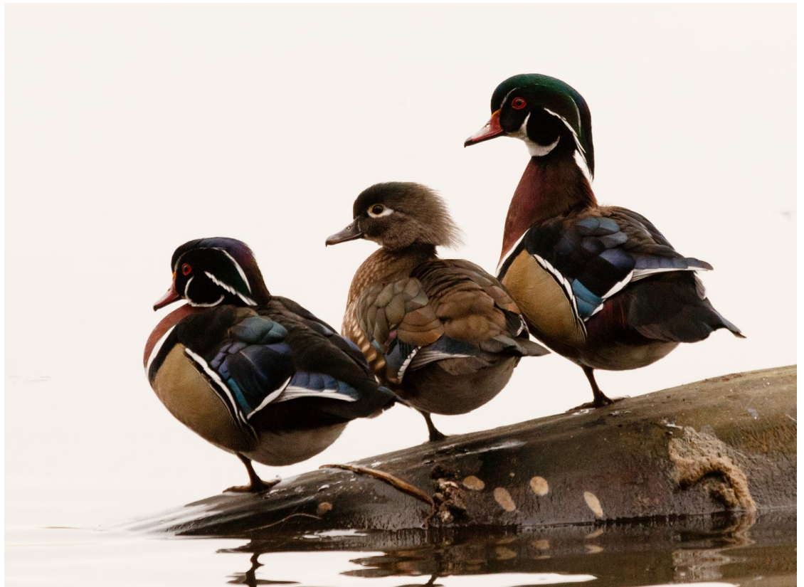
Second Place Wood Duck Trio Steve Lightle