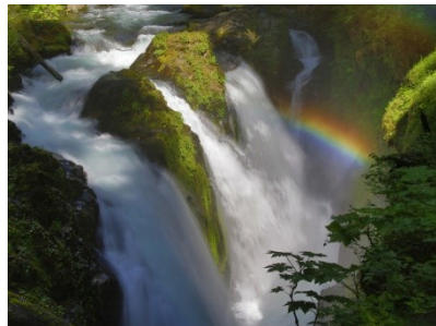
"Sol Duc Falls"