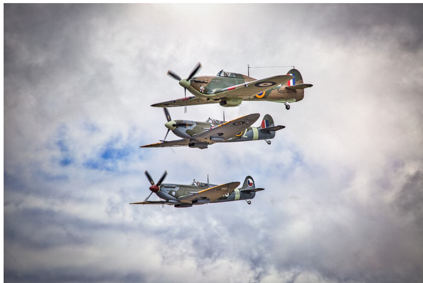
Honorable Mention RAF Fighters Gary Lingenfelter