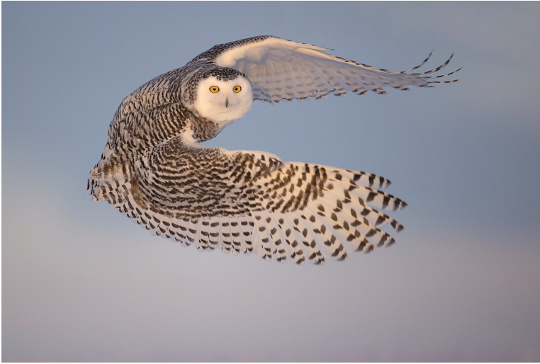
First Place Evening Flight Sharon Ely