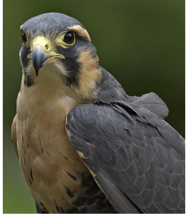
Honorable Mention Peregrine Falcon Renata Kleinert