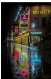
"Seattle Waterfront Night"