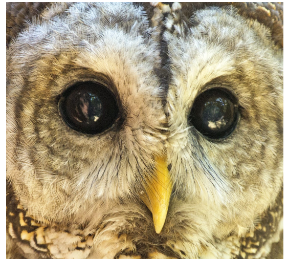
Second Place Owl Eyes Rentata Kleinert