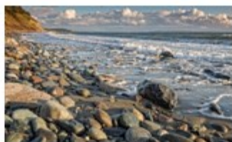
"Evening Light W Ebey's Landing"