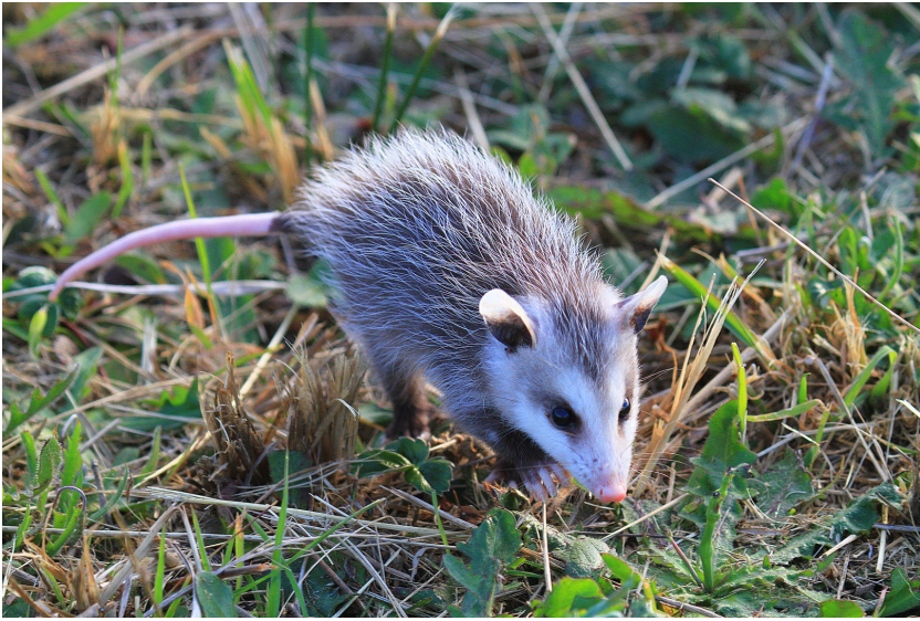
First Place Opossum Jim Basinger