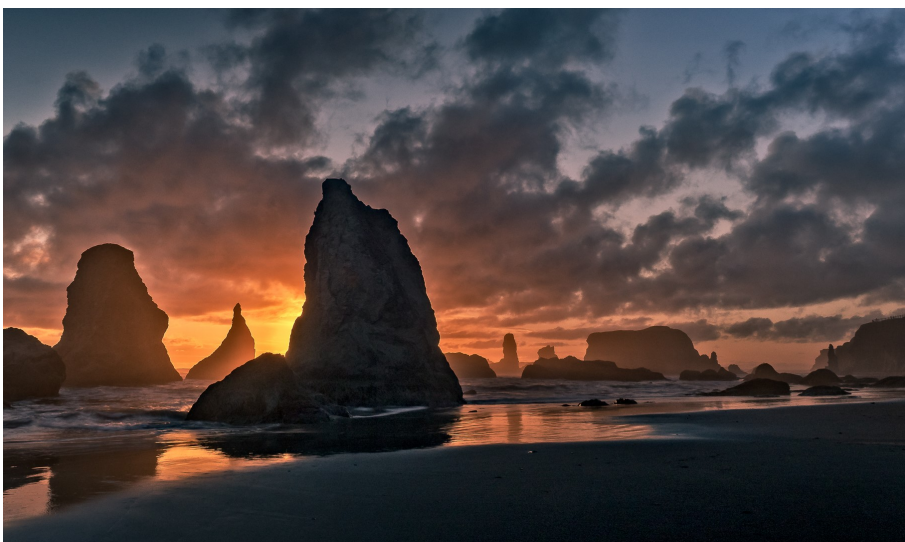
Second Place Fire in the Sky Greg Thomas