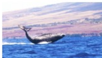
"A Whale Surfing"