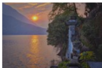
"Lake Como, Italy"