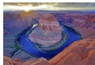
"Horseshoe Bend Canyon" © Renata Kleinert