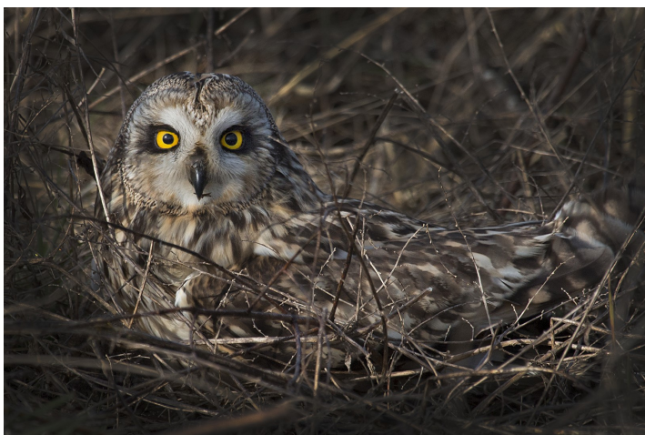
Second Place Owl in the Grass 2 Sonya Lang