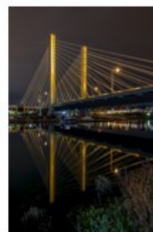
"Thea Foss Waterway"