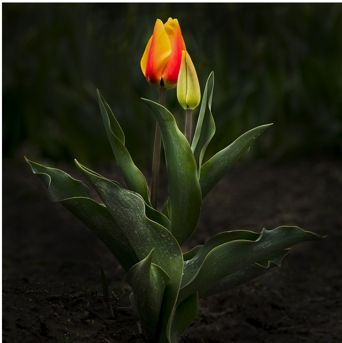
Second Place Tulips a Glow Sonya Lang