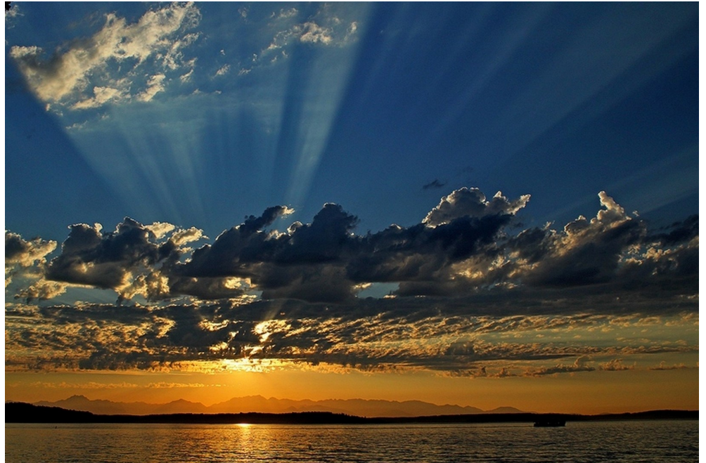
Second Place Sunset Burst Paula Bailly