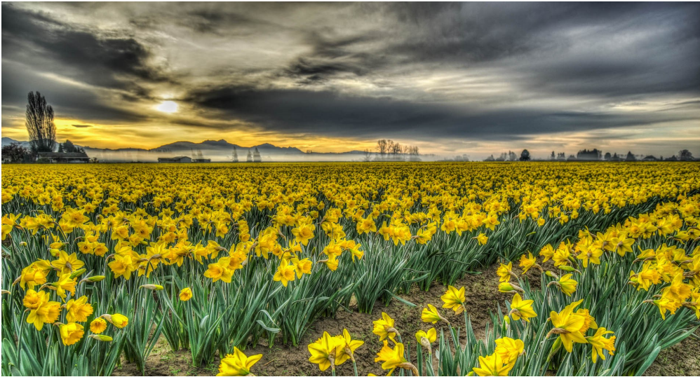
First Place Morning at a Daffodil Field Gary Lingenfelter