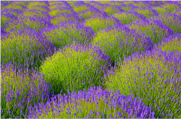
Second Place Lavender Fields Renata Kleinert