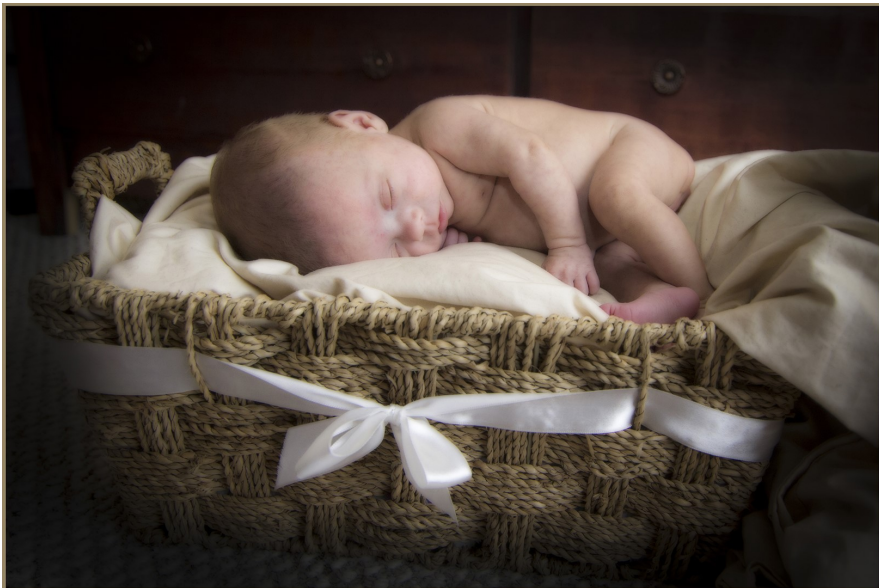
First Place Mckenzie Sonya Lang