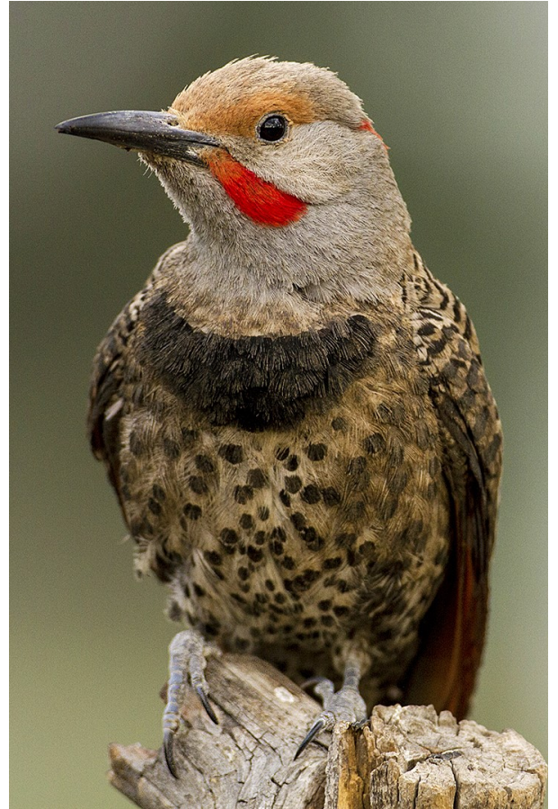
First Place Northern Flicker Sharon Ely