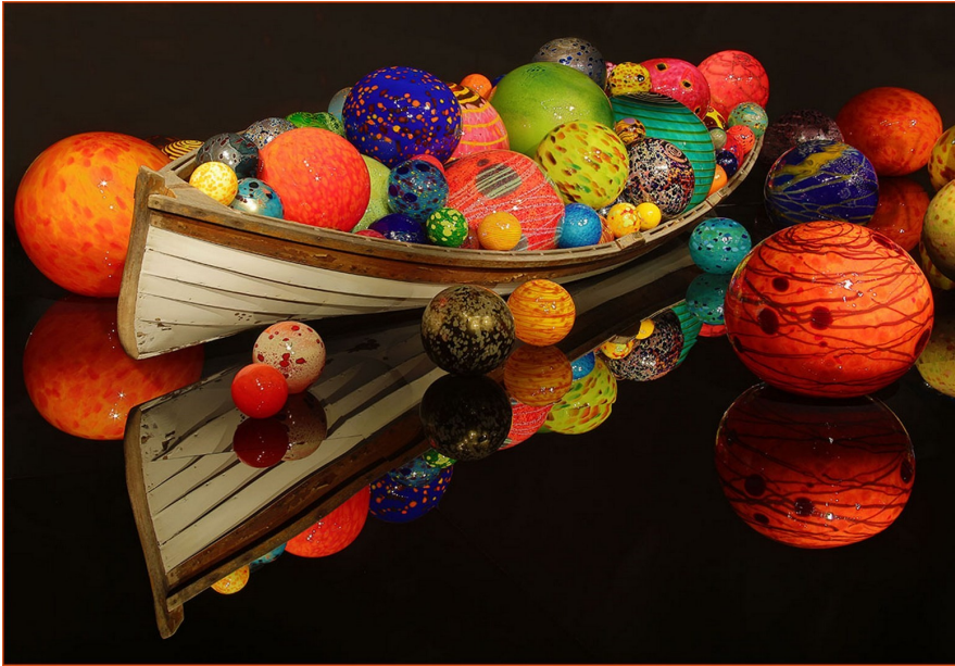
First Place Glass Reflections Renata Kleinert