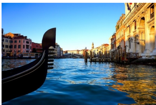
"Grand Canal, Venice" Gary Lingenfelter