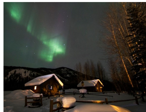
"Under The Lights at Chena Hot Springs" Tracy Carson