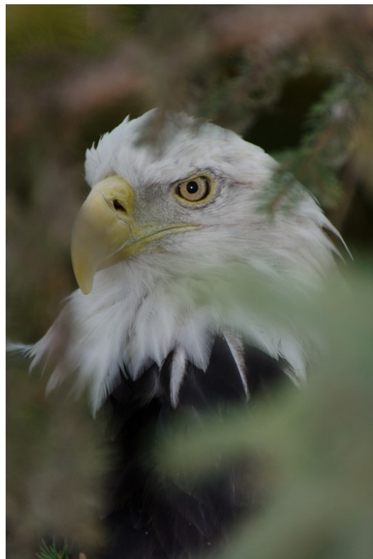
"Watching You" – 21 pts