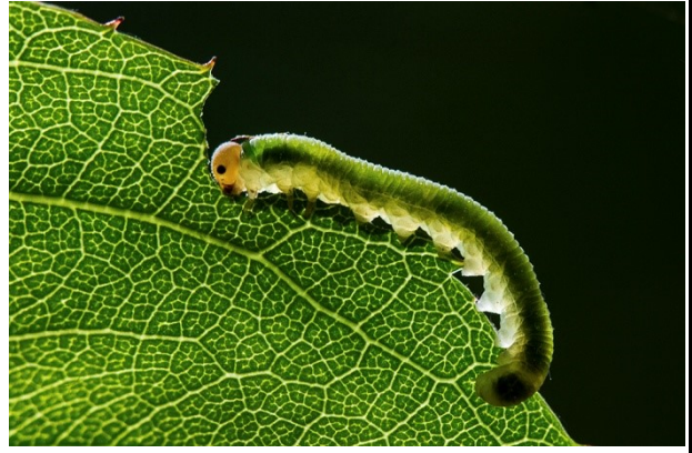
"Munching On Lunch" – 24 Pts