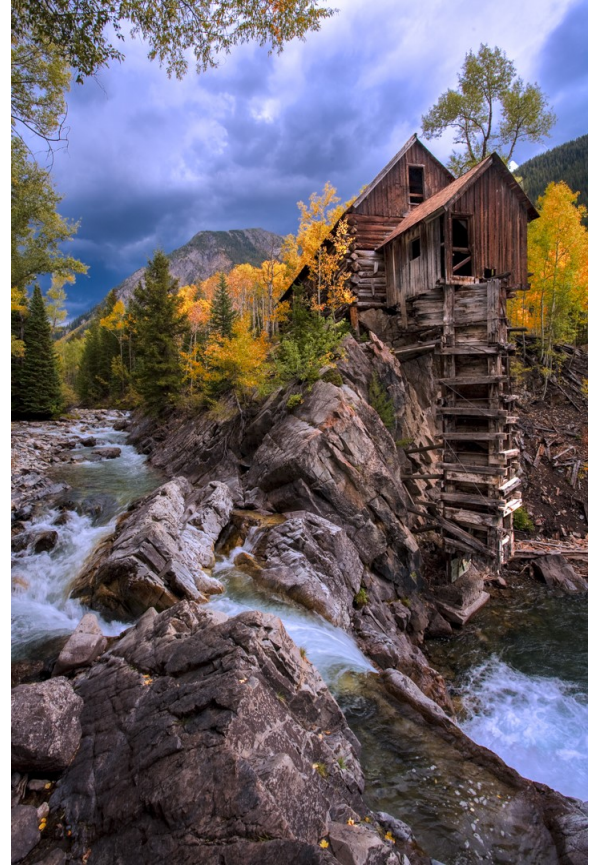
Second Place Crystal Mill Bill Schwarz