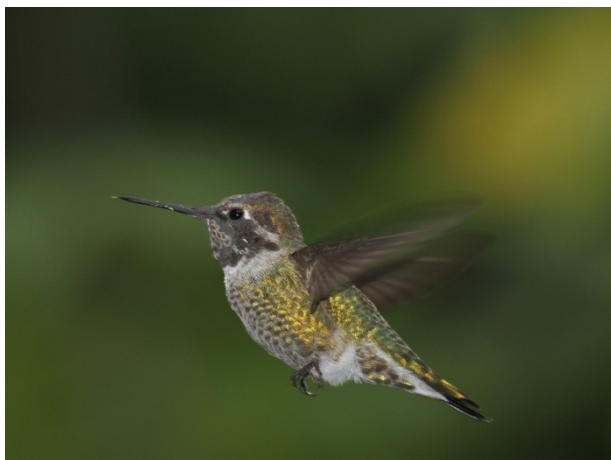
"Hummer 2" – 21 pts © Jim Basinger