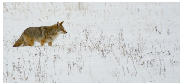
"Hunting Coyote 01" – 19 Pts