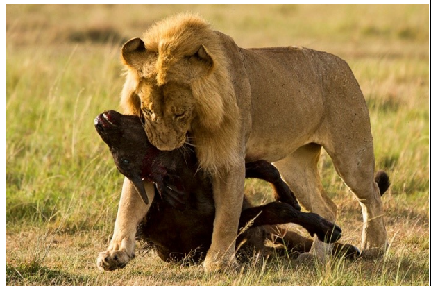
"Dinner" – 29 Pts