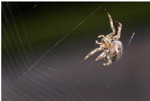
"Spider Web 6" – 22 Pts © Sonya Lang