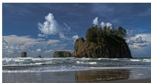
"Intesne Colors Of Morning" Greg Thomas