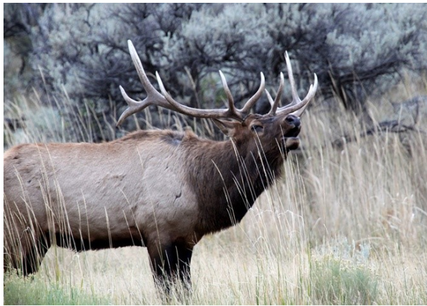
"Bugling Elk" – 21 Pts