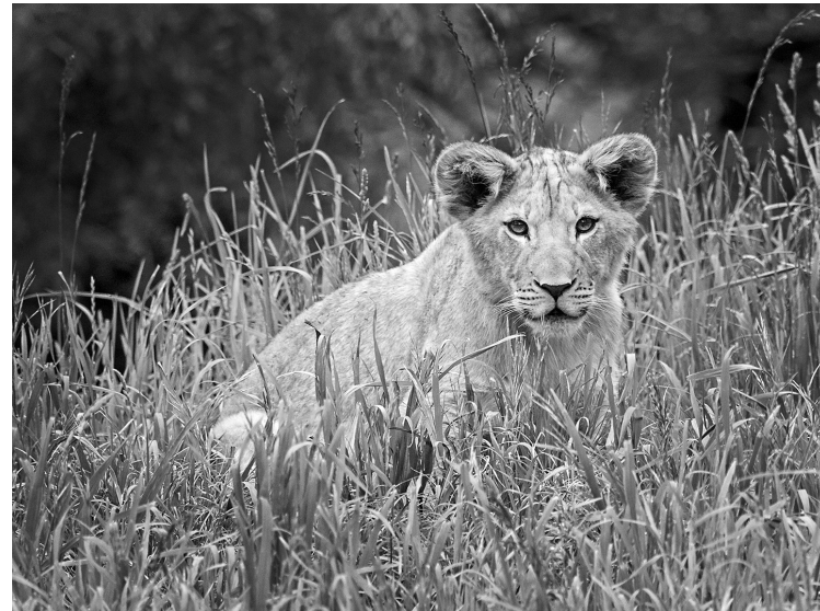
Third Place Cub Spotted Sonya Lang