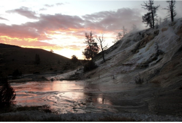
"Mammoth" - 3 Pts Hand Of Man Evident