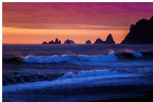
"Rialto Sunset 2" Sonya Lang