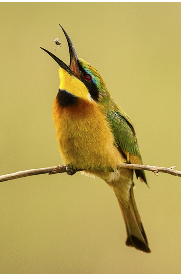
"Decisive Moment" – 28 Pts