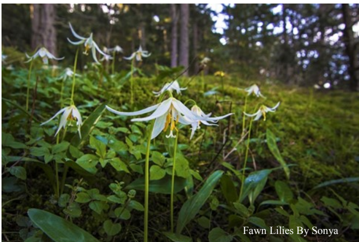
Fawn Lilies By Sonya

We arrived at Washington Park around 8:15 AM where the skies were partially cloudy interspersed with great big patches of blue sky, mild breeze and just a bit chilly.