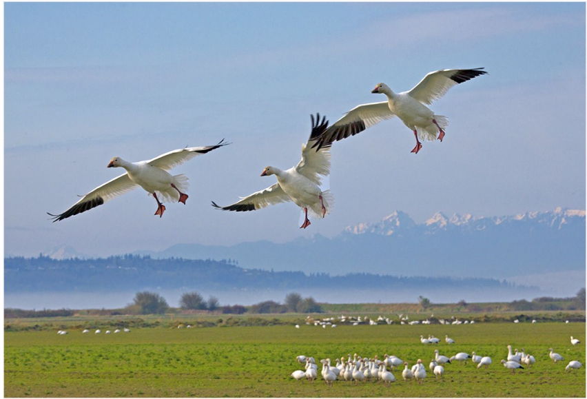
First Place Snow Geese Renata Kleinert