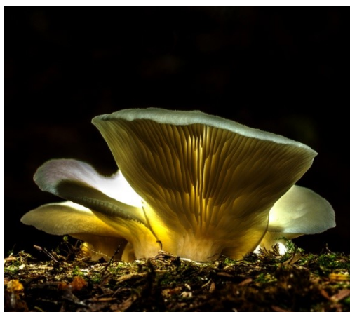
"Illumination #2" Steve Lightle