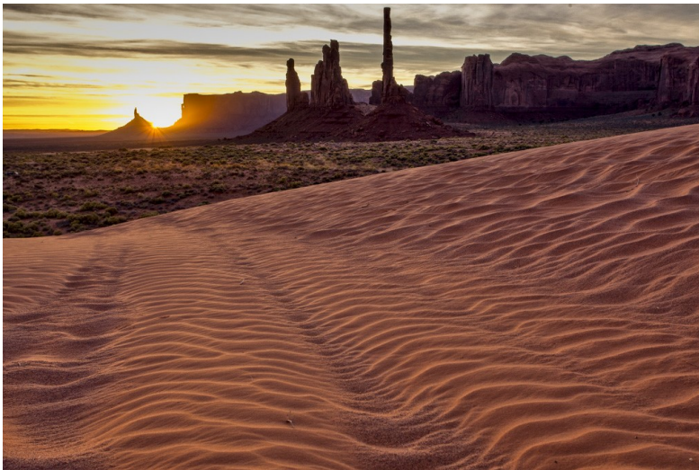
First Place Totem Pole Bill Schwarz