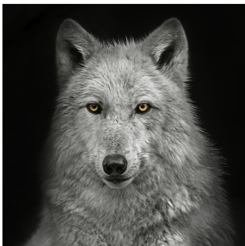
"Those Eyes" Sonya Lang