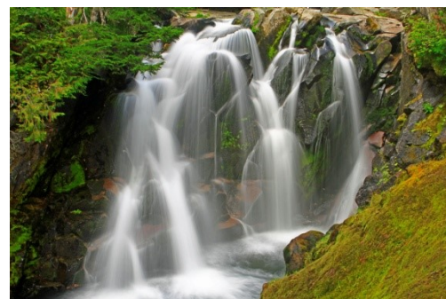
"Waterfall On Paradise River " Sherrie Tallman