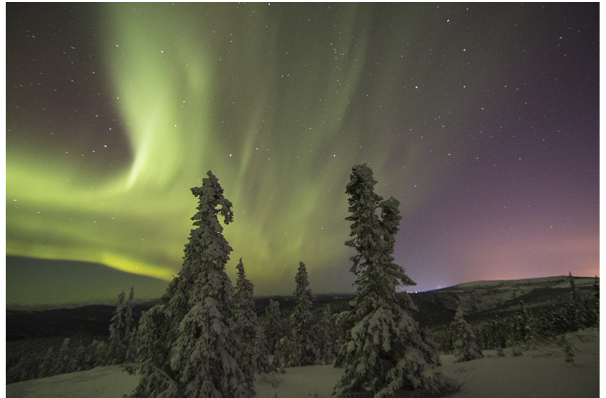
Honorable Mention Skiland Lights Tracy Carson