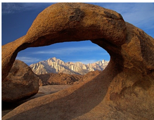
"Arch Beneath Mount Whitney" Renata Kleinert