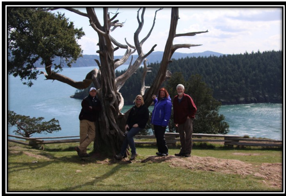
Group Image By Tracy Carson (via 10 second timer )

Here's the group at the view point – as you can see a marvelous view and fantastic weather!