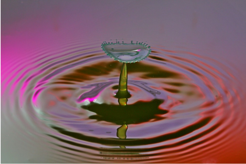
Honorable Mention Splash Jim Basinger