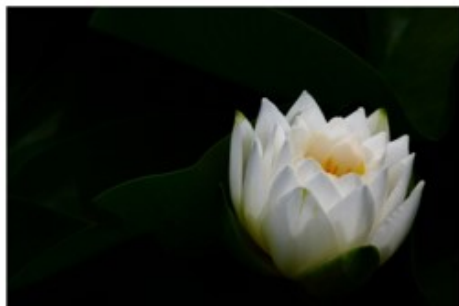
"Blackman's Lake Lily #2" – 6 pts