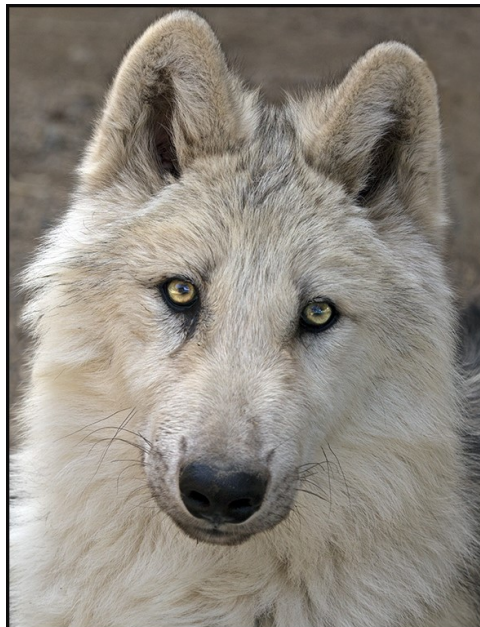
Honorable Mention Young Wolf Renata Kleinert

Once photography enters your blood stream, it's like a disease.