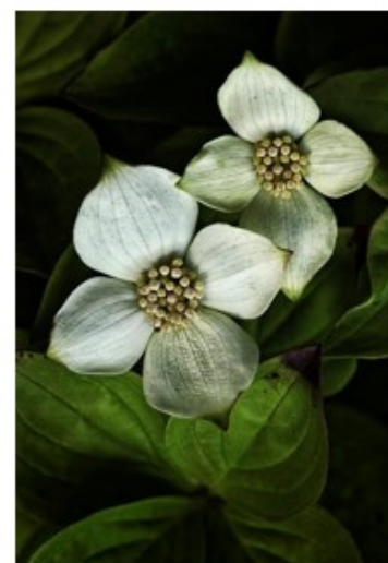
"Bunchberry" – 6 pts