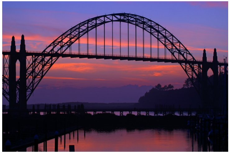
Honorable Mention Yaquina Bay Bridge Sunset Jim Basinger