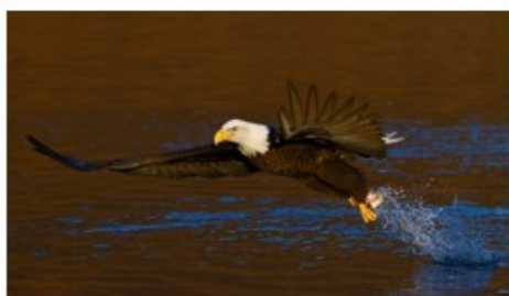
"Nice Catch" – 14 Pts HM