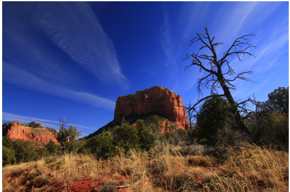
Canon 7D, Canon 10-22 lens, polarizer filter, ISO 100, aperture priority, f/22, focal length 15, exposure time 1/13, exposure compensation -2/3.

In January of 2014 I went to Arizona to see my parents. Sedona was by far my favorite part of our travels, although we only spent 4-5 hours driving around looking at the rock monuments. A lot of planes departing from Phoenix travel above Sedona. Some of the clouds in this photo are contrails from jets passing overhead. My time was limited that day, but I intend to go back some day on my own. There's nothing I love more than loading my camping and photography equipment into my SUV and going adventuring!