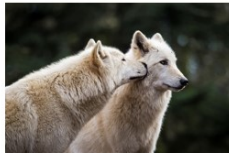
"Wolf Kiss " – 6 Pts