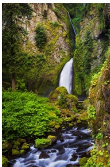
"Wahcella Falls #2 " – 14 Pts HM