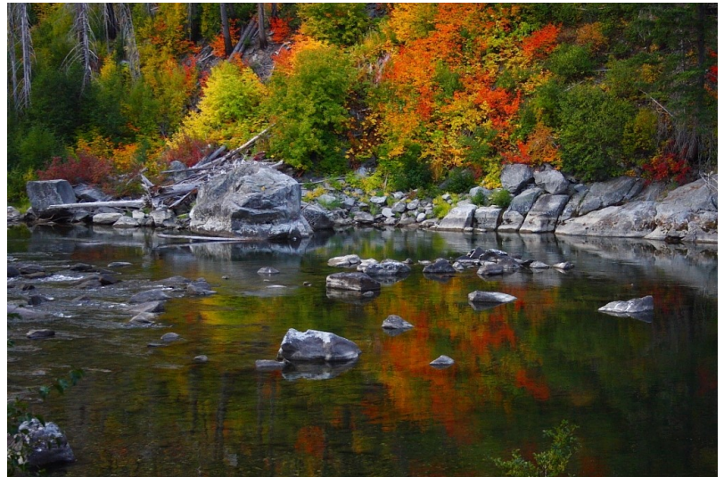
3rd Place Fall Colors Jim Basinger