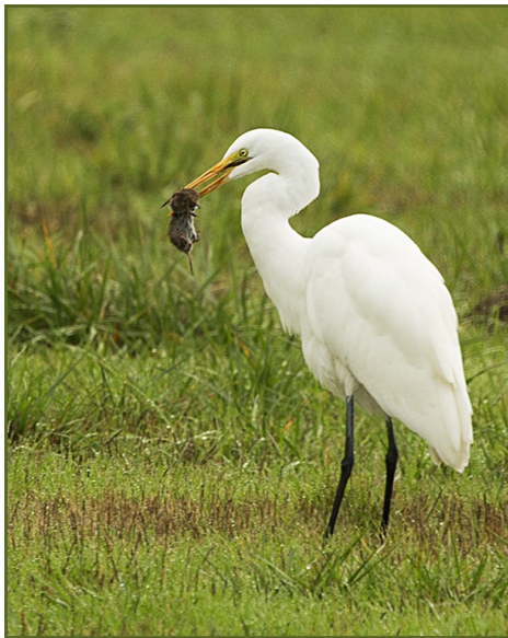
Honorable Mention Egret with Mouse Renata Kleinert