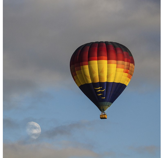
2nd Place Over the Moon Sonya Lang