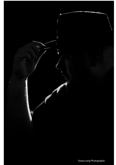
Canon 60D, ISO 400, 100mm, f/20 1/200 sec.

The image you see here was done with a single flash on a stand behind the model triggered by a remote on my camera to create the silhouette.