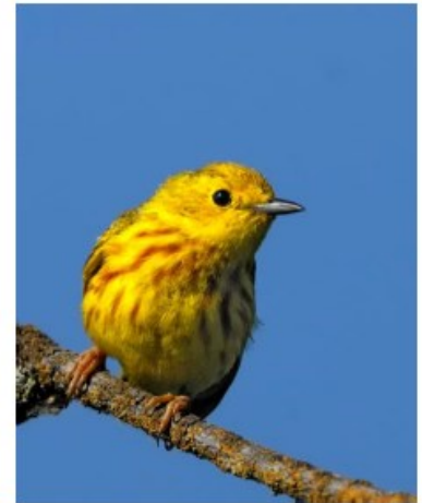
“Yellow Warbler” –7 Pts Bill Dewey