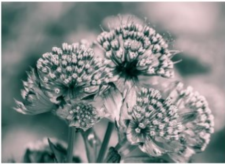
“Explosive Texture” – 6 Pts Greg Thomas