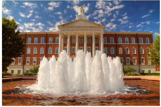
Second Place Water Columns Tim Garton