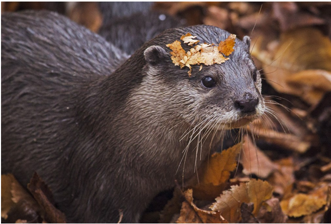
Honorable Mention Autumn Otter Sonya Lang