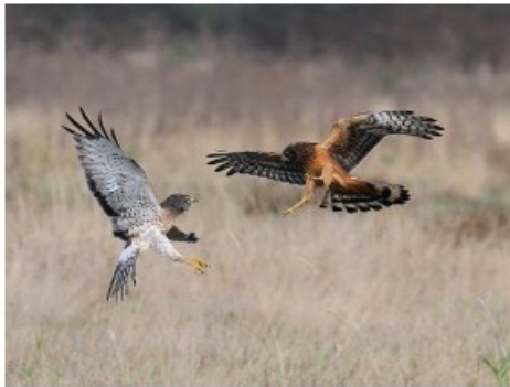
“The Fight” –9 Pts Jim Basinger