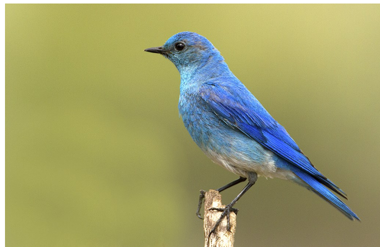
Honorable Mention Mountain Blue Bird Sharon Ely