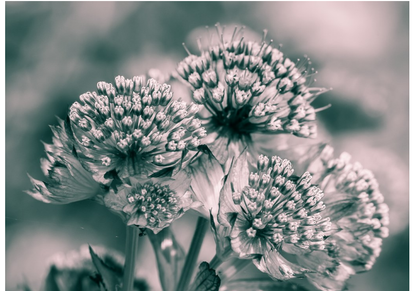
Second Place Explosive Texture Greg Thomas