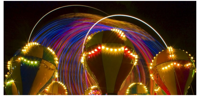
Balloons- 20mm, f/20, 8 sec., ISO

Summer time is filled with many opportunities to attend community carnivals and fairs and they offer such a wide range of photo opportunities in one place from photojournalism, food, abstract, to rides in motion.