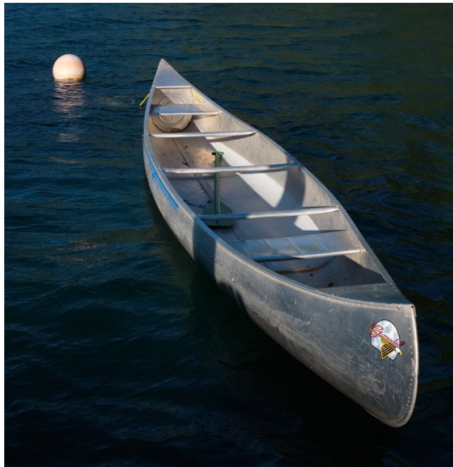
Image was made with a Fujifilm X100, fixed lens, camera. My wife and I were guest of a wedding ceremony at the Naturebridge facility at Lake Crescent in the Olympic National Park.

Image is an ambient light picture, hand held, captured while standing on a dock. There was a stiff breeze at the time. The canoe was swinging on its mooring line. I waited for the "right moment" and tripped the shutter when I thought it was time. Minor tweaking of contrast and brightness was performed in the computer along with some cropping.