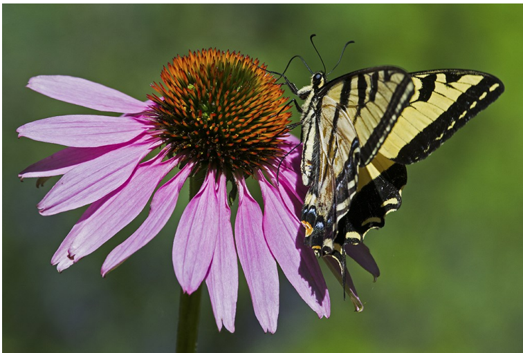
1st Place Swallowtail on a Coneflower Sonya Lang