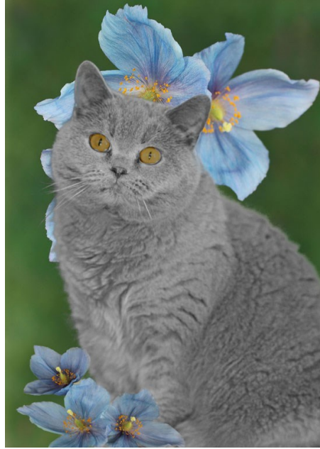
2nd Place Gracie and Blue Poppies #2 Janet Wright