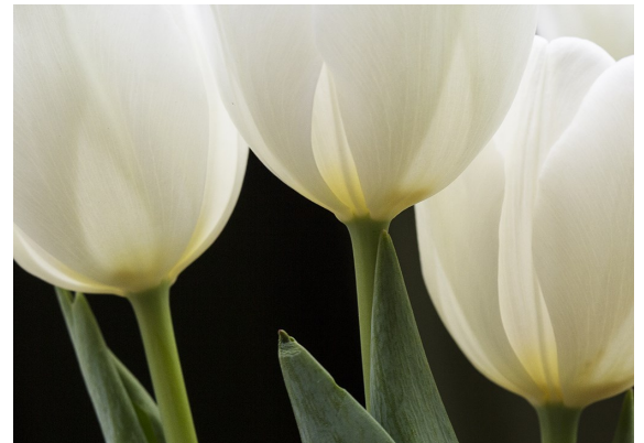
Honorable Mention WHITE GLOW Sonya Lang