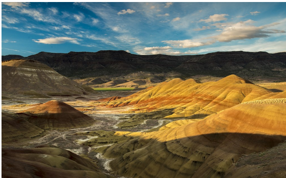
Honorable Mention PAINTED HILLS OVERLOOK TRAIL Kevin Siefke