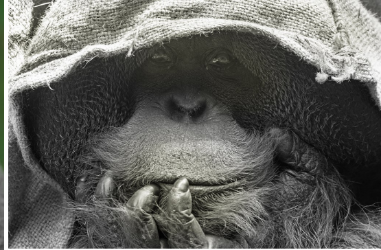
2nd Place Orangutan Sonya Lang