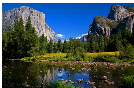
YOSEMITE BY RENATA KLEINERT HONORABLE MENTION