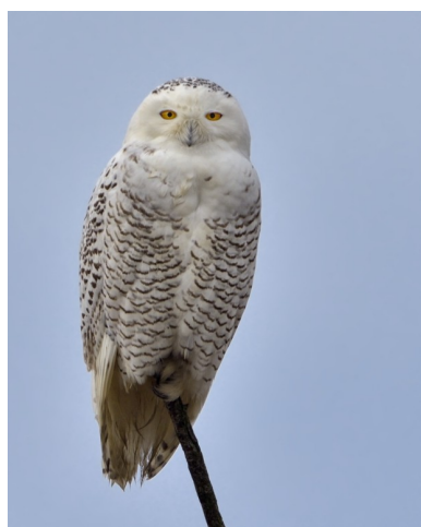
SNOWY OWL ON STICK BY BILL DEWEY SECOND PLACE