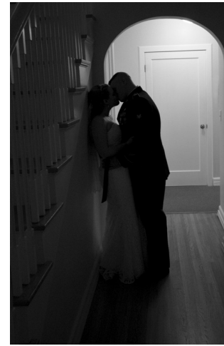
WEDDING SILHOUETTE BY SONYA LANG HONORABLE MENTION