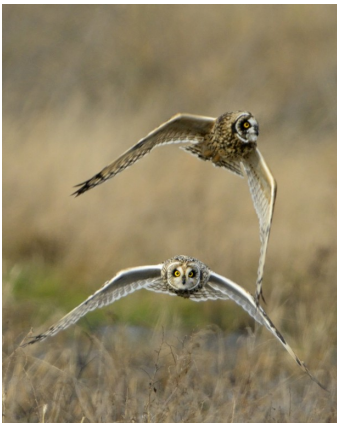
SHORT EARED OWL PAIR BY BILL DEWEY HONORABLE MENTION