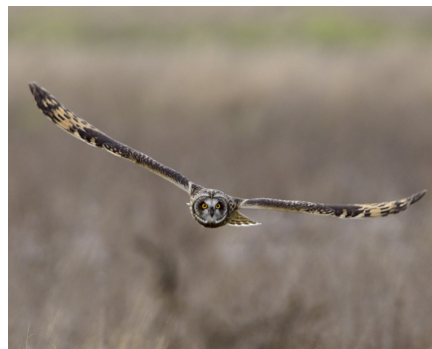
LOOKING AT YOU SHORT EARED OWL BY BILL DEWEY SECOND PLACE