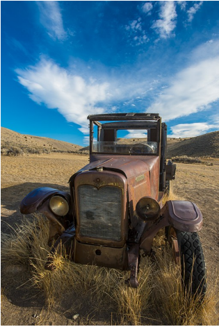
INTERNATIONAL TRUCK BY KEVIN SIEFKE HONORABLE MENTION