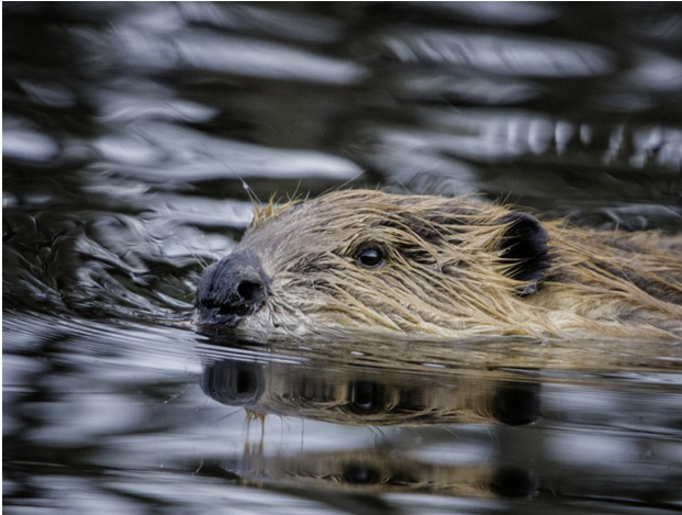
REFLECTIONS JUVENILE BEAVER BY BILL DEWEY SECOND PLACE