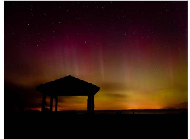
CAMANO AURORA 3 BY SHANE ELEN SECOND PLACE