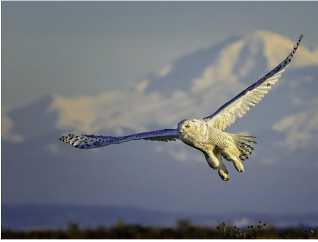
SNOWY OWL SUNSET BY BILL DEWEY SECOND PLACE