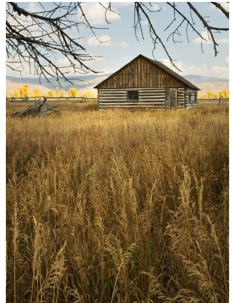
GOLDEN BARN BY SONYA LANG SECOND PLACE