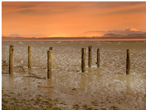
NOT AN AURORA 2 BY JANET WRIGHT SECOND PLACE