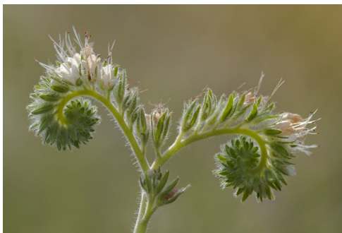
FIDDLENECK # 1 BY KEVIN SIEFKE HONORABLE MENTION