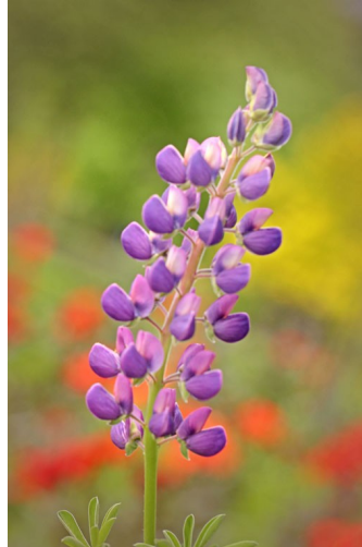
LUPIN # 6 BY JANET WRIGHT HONORABLE MENTION