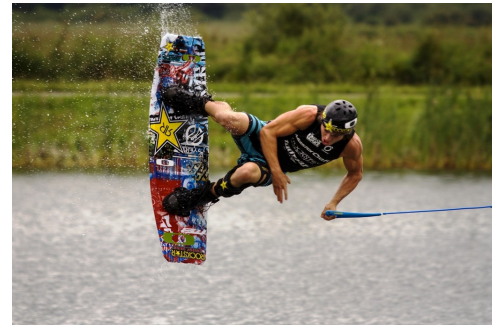
WAKE BOARDER BY SONYA LANG SECOND PLACE