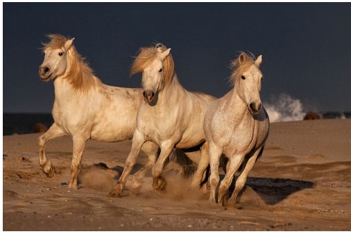
RIDING THE WIND BY SHARON ELY FIRST PLACE