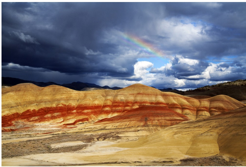
PAINTED HILLS # 2 BY RENATA KLEINERT SECOND PLACE