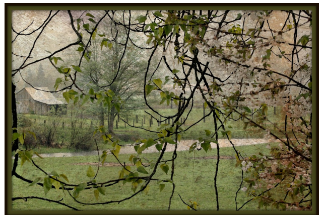
OLD FARM BY JERRY SORENSEN HONORABLE MENTION