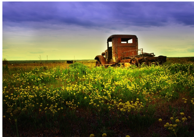
OUT TO PASTURE BY SONYA LANG THIRD PLACE