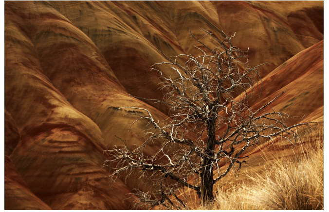
DESOLATE TREE BY STEVE LEGHTLE SECOND PLACE