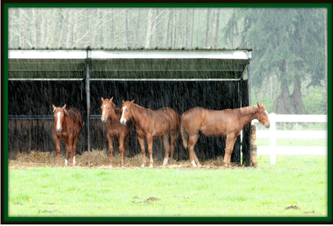
WAITING IT OUT BY JERRY SORENSEN FIRST PLACE