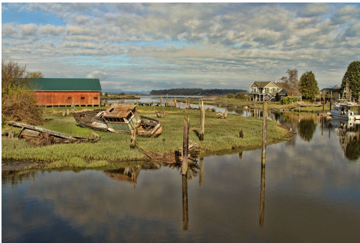
OLD BOAT AND RED BARN BY JANET WRIGHT SECOND PLACE