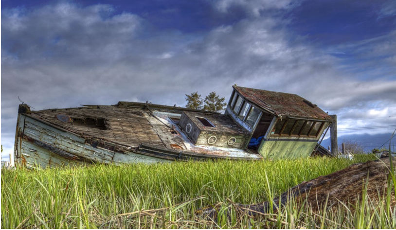
OLD BOAT BY DAVID VANKEUREN FIRST PLACE