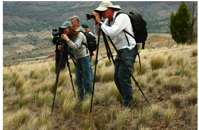
CAUGHT UP IN THE MOMENT