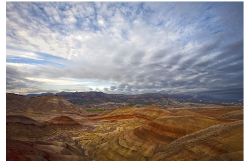
WE SAW THE PAINTED HILLS EACH DAY WE COULD FOR SUNRISE AND SUNSET