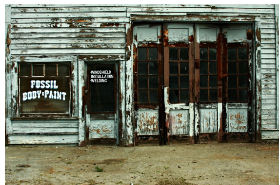
WE SAW OLD BUILDINGS