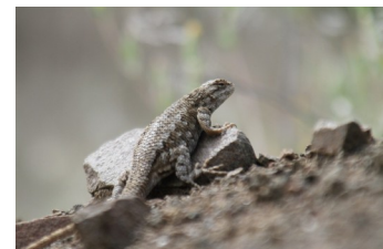
JIM WAS IN PERSUIT OF THE CRITTERS FOUND A BUNCH TOO