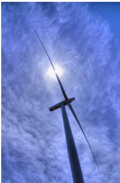
WE SAW WIND TURBINS