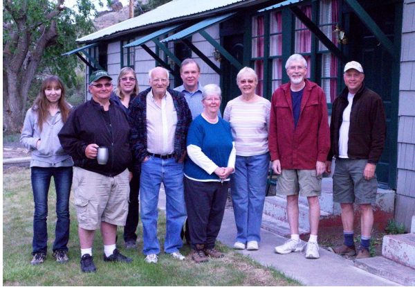
THE GROUP THAT WENT