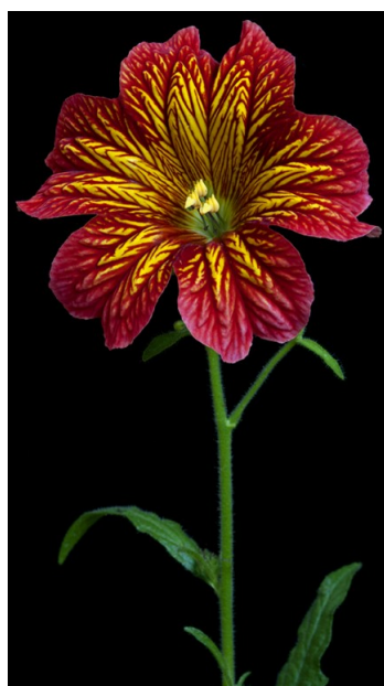
PRETTY FLOWER BY RENATA KLEINERT SECOND PLACE