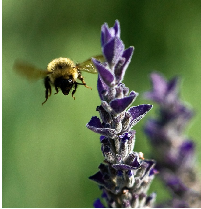
BEE AND LAVENDER

The shot was taken at my cabin on Whidbey Island in August. It was shot handheld while on my knees to get to the bee's level .