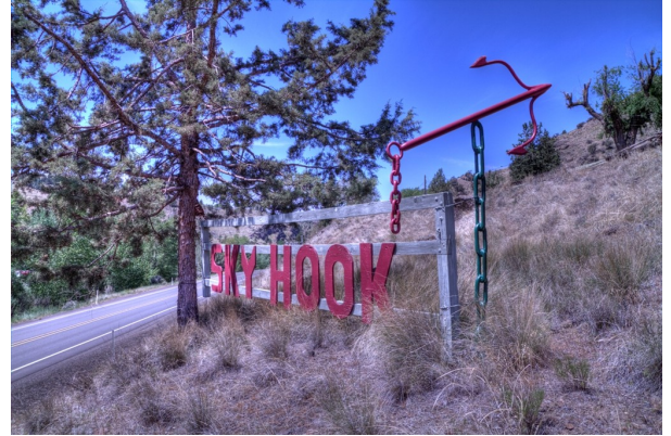
THE SIGN FOR THE MOTEL WE HAD 5 OF THE 6 ROOMS