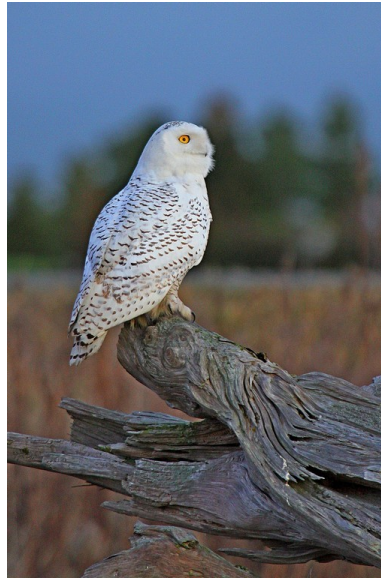
SNOWY OWL BY JIM BASINGER THIRD PLACE