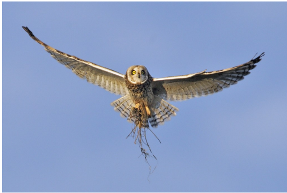
SHORT EARED OWL 1 BY BILL DEWEY FIRST PLACE