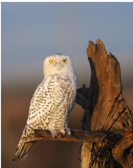
SNOWY OWL FIRST LIGHT BY BILL DEWEY THIRD PLACE