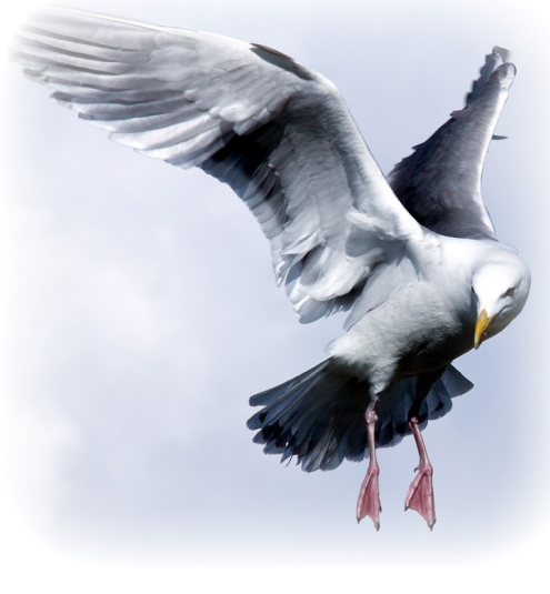
SEAGULL IN FLIGHT BY JERRY SORENSON THIRD PLACE