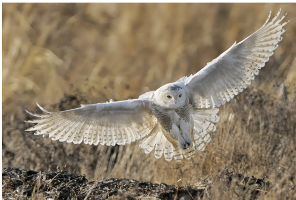
SNOWY OWL LANDING THIRD PLACE