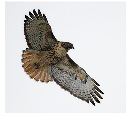
RED TAILED HAWK BY JIM BASINGER HONORABLE MENTION