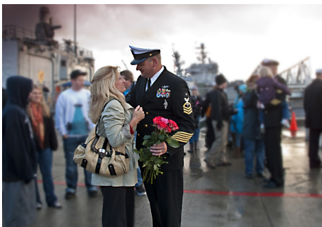
HELLO DARLING BY SHIRLEY STICH HONORABLE MENTION