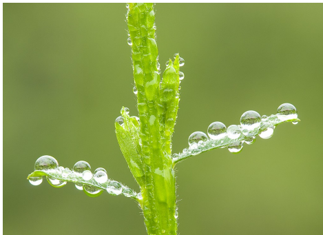
WATER DROPS ON LEAF BY KEVIN SIEFKE THIRD PLACE