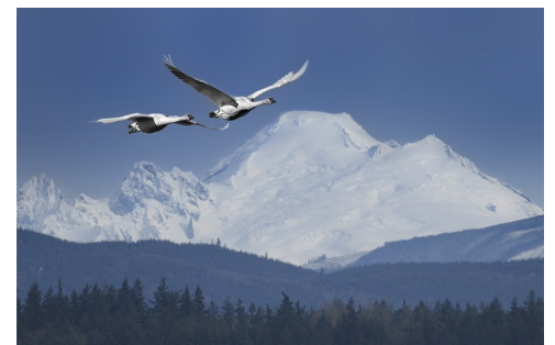
MT BAKER TRUMPETER SWANS BY BILL DEWEY HONORABLE MENTION