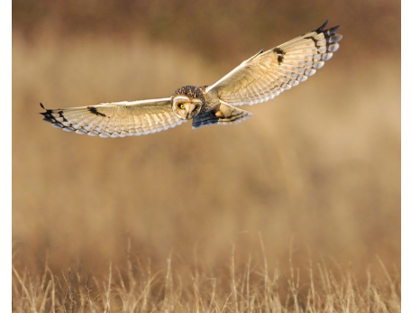
ON THE HUNT SHORT EARED OWL BY BILL DEWEY FIRST PLACE