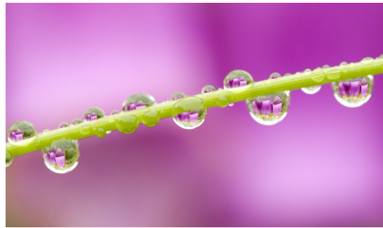
FOXGLOVE IN WATERDROPS BY KEVIN SIEFKE FIRST PLACE