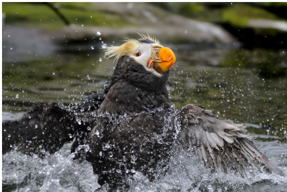
TUFTED PUFFIN DISPLAY BY BILL DEWEY THIRD PLACE