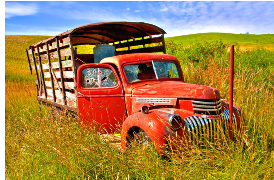
YEARS GONE BY BY RENATA KLEINERT HONORABLE MENTION