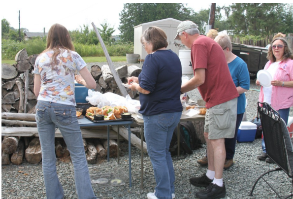
GOOD PEOPLE GOOD FOOD

WE HAD 13 PEOPLE AT THE PICNIC. NOT ALL WERE IN THIS PICTURE. LOTS OF GOOD SOCIALIZING