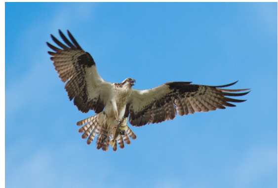
OSPREY WITH FISH THIRD PLACE