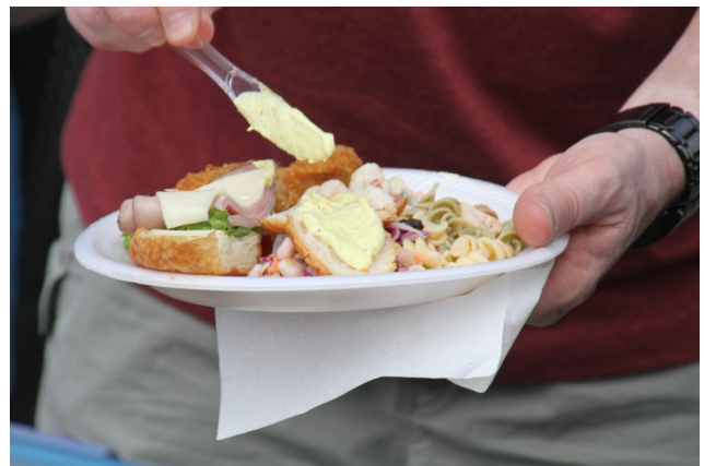
LOTS OF GOOD FOOD