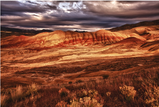
PAINTED HILLS BY RENATA KLEINERT HONORABLE MENTION