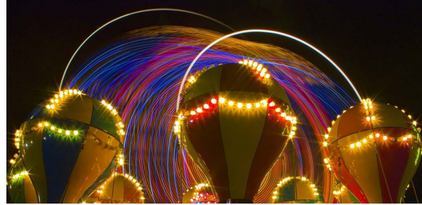
CARNIVAL BALLOONS BY SONYA LANG HONORABLE MENTION