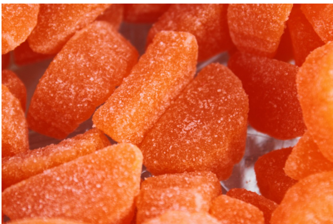
CANDY ORANGE SLICES