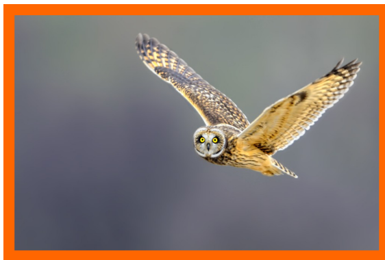
SHORT EARED OWL BY BILL DEWEY FIRST PLACE