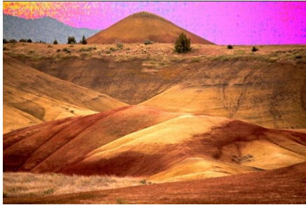
“The Pyramid” by Renata Kleinert

I’ve photographed Camas flowers a number of times near Anacortes; solitary flowers. I had no idea that they grew in fields like we found at Scatter Creek. I never knew they came in any color other than blue/purple