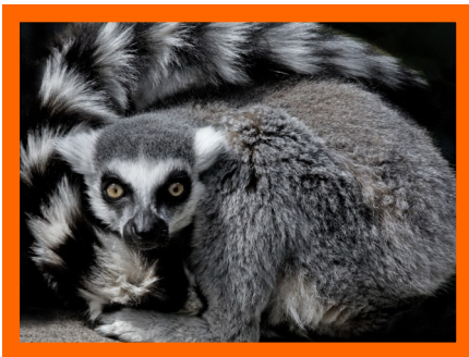
I SEE YOU BY RENATA KLEINERT SECOND PLACE