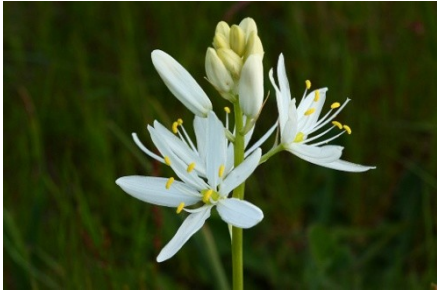
“White Camas” by Steve Lightle

I’ve photographed Camas flowers a number of times near Anacortes; solitary flowers. I had no idea that they grew in fields like we found at Scatter Creek. I never knew they came in any color other than blue/purple