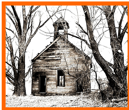
SCHOOL HOUSE MEMORY BY SONYA LANG HONORABLE MENTION