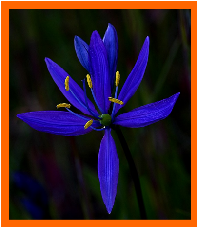
CAMAS 2011 BY STEVE LIGHTLE HONORABLE MENTION