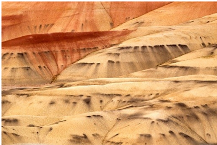
“Painted Hills” by Sharon Ely

Looks like a Pyramid to me. I thought this turned out really cool. Taken @ f6.3 @1/250, ISO 160 with a 100-400 lens @ 400mm. Because of the blank sky I enhanced it in Photoshop by using hue and saturation.