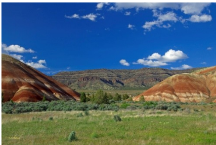
“Painted Hills

My favorite of the trip appears as though someone daubed black paint on the hills and then quickly pulled the paintbrush downward.