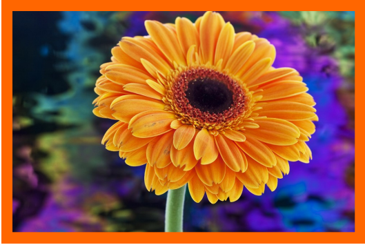
SUNFLOWER BY SHIRLEY STICH THIRD PLACE