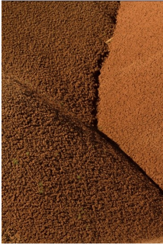
“Texture & Pattern” by Jim Basinger

This image was taken because of the texture and the pattern. Was surprised when the light part came out lighter than I expected. I had my camera set to shade to warm up the colors.