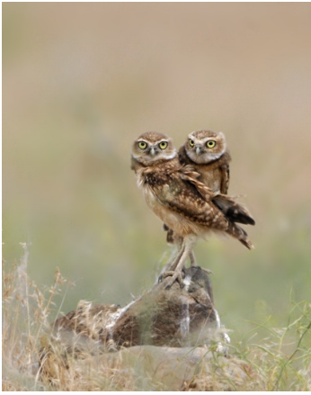
BURROWING OWL SIBLINGS BY BILL DEWEY FIRST PLACE