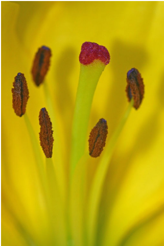
SPRING 2008 BY STEVE LIGHTLE SECOND PLACE