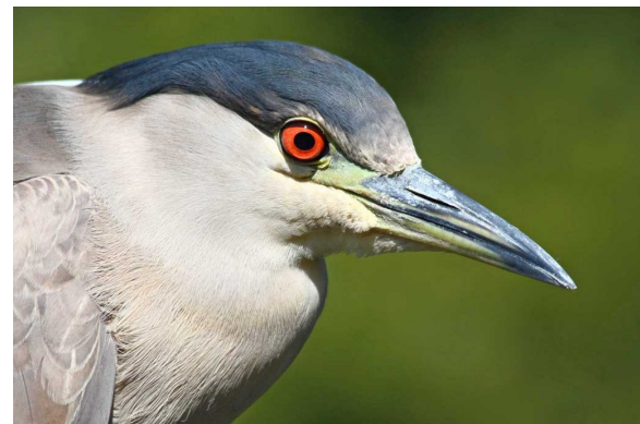
NIGHT HERON 2011 BY JANET WRIGHT SECOND PLACE