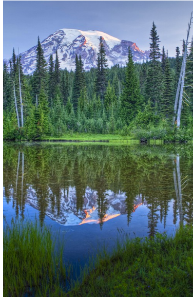
REFLECTION LAKES BY KEVIN SIEFKE HONORABLE MENTION