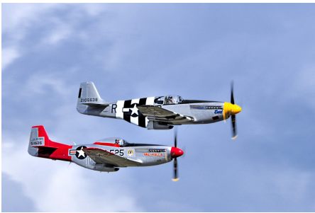
PAIR OF MUSTANGS BY BILL DEWEY HONORABLE MENTION