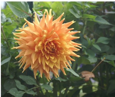
YELLOW DAHLIA BY CAROL DELAUNE HONORABLE MENTION