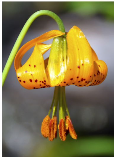
WILD LILLY 1 BY ANNA RICE HONORABLE MENTION