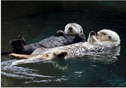
OTTERS BY SHIRLEY STICH SECOND PLACE