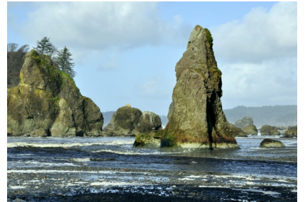
ALONG ROUTE 101 BY ANNA RICE HONORABLE MENTION