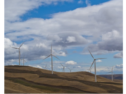
WASHINGTON WINDMILLS BY SHIRLEY STICH SECOND PLACE