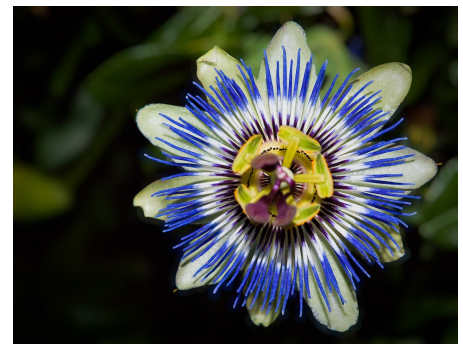
PASSION FLOWER 1 BY CLAW KELSAY HONORABLE MENTION