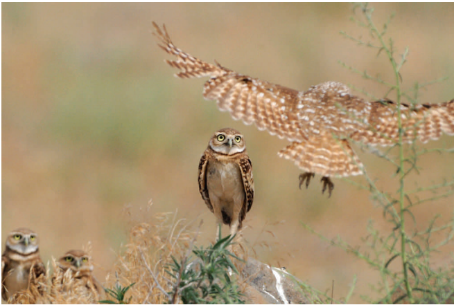
3rd—Burrowing Owl- Mom Comes Home By Bill Dewey