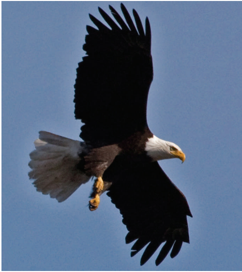
3rd- Fly Like an Eagle By Renata Kleinart