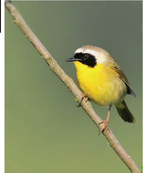
Common Yellowthroat 1 By Bill Dewey