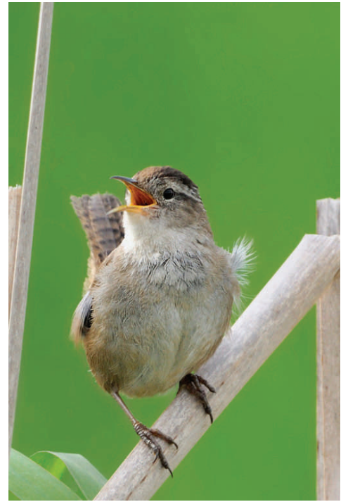
1st—Marsh Wren Singing