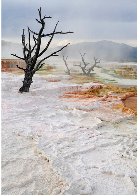
2nd—Canary Spring