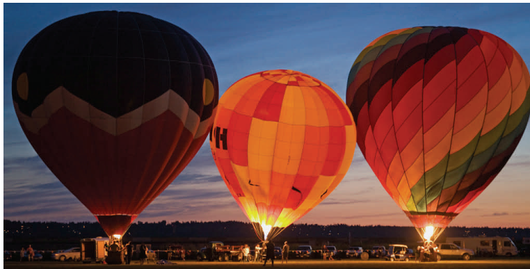
Balloon Glow by Renata Kleinart