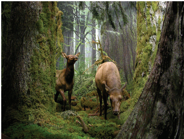
Ancient In habitants