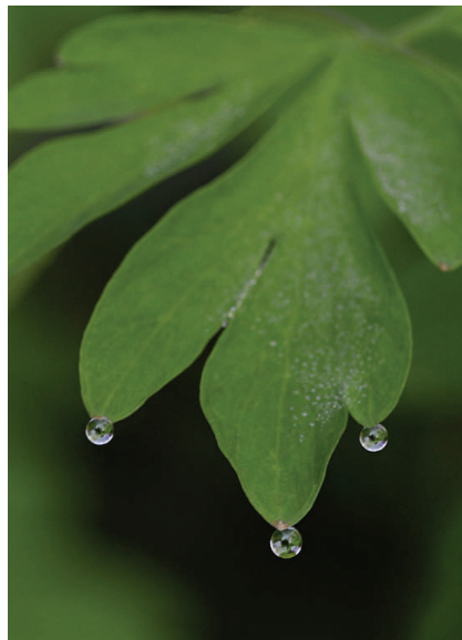
Drops on Corydalis By Kevin Siefke