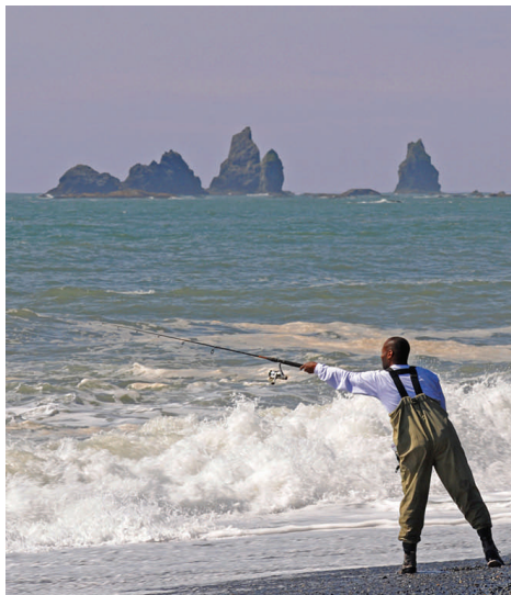
Surf Fishing—10 pts