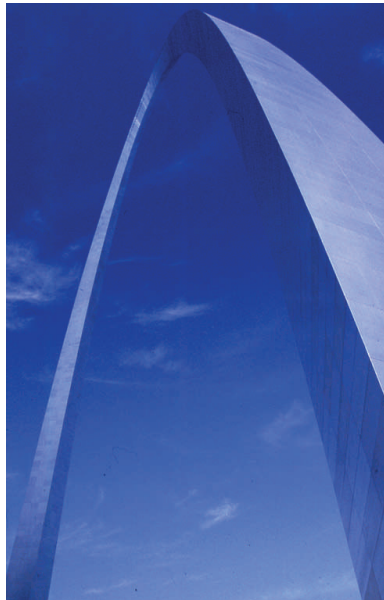
St. Louis Arch—11 pts