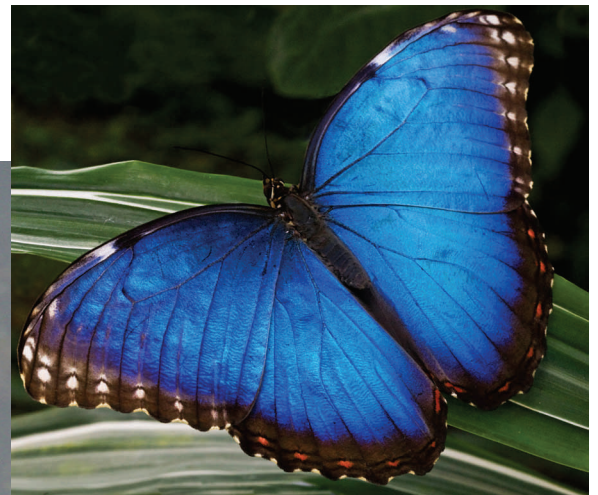
2nd—Blue Moroplo Butterfly By Renata Kleinert