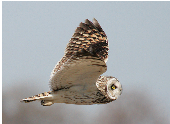
Short Eared Owl—8pts By Jim Basinger