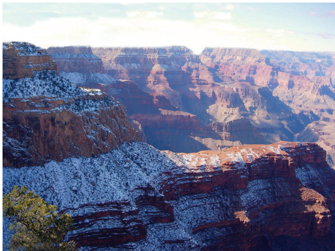
Grand Canyon 4—9pts By Joyce Harvey