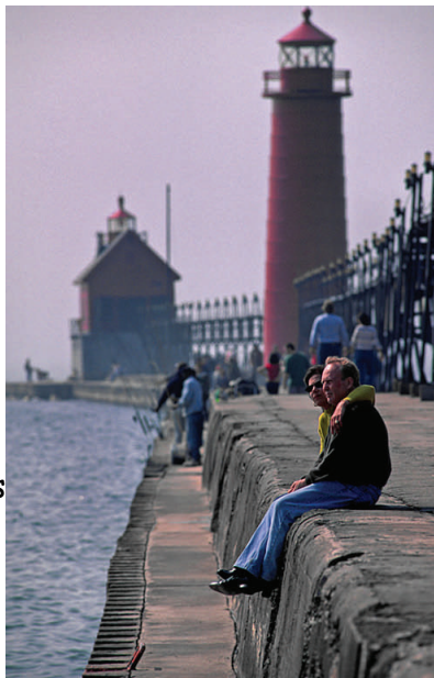
Grand Haven 9 pts