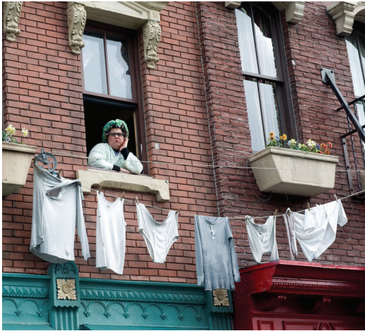
New York Laundry Woman—12 pts