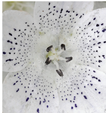
Baby Blue Eyes By Kevin Siefke