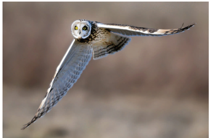
2nd—Focused Short Eared Owl