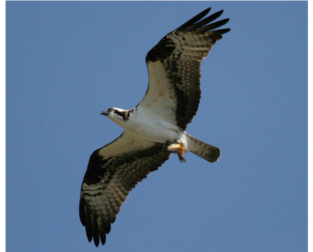
2nd—Osprey