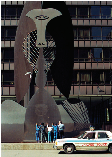
My Kind of Town—9 pts