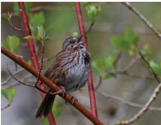
Song Sparrow