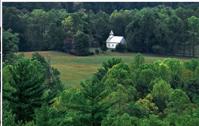
Cades Cove—10 pts By Kevin Siefke