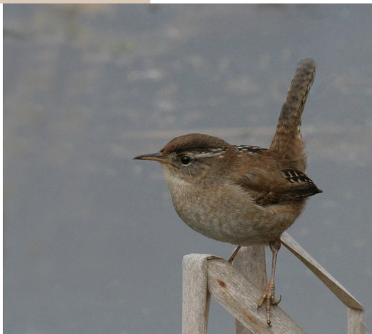
2nd—Marsh Wren