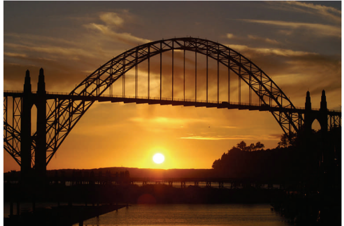
Yaquina Bay Bridge—12pts