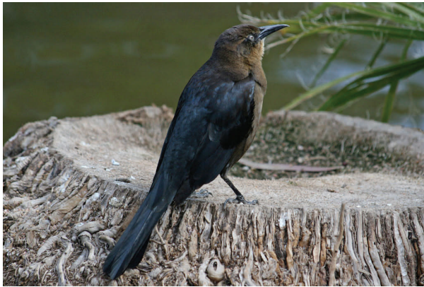
Black Bird By Norm Kreger