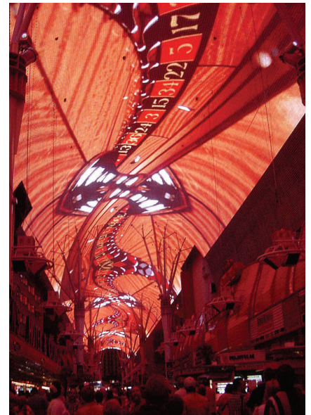
Freemont Street—10 pts