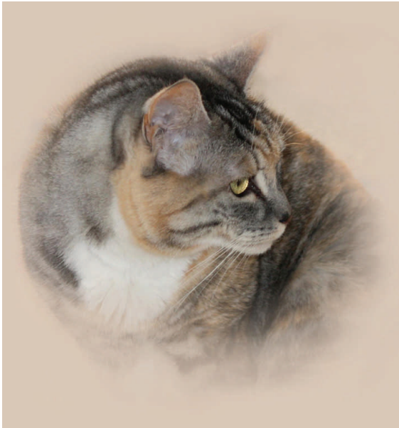
2nd—Grace By Shirley Stich