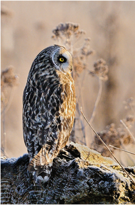
1st— Dawn Introspection Shorteared Owl