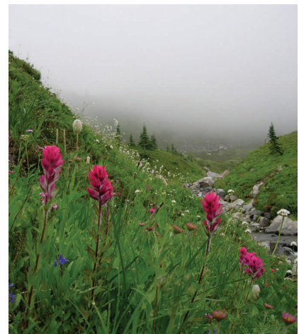
Foggy Day—7pts By Joyce