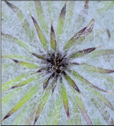
Thistle 1 By Kevin Siefke First Place