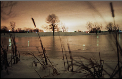
December in Illinois