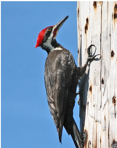
PILEATED WOODPECKER BY JIM GENIESSE THIRD PLACE